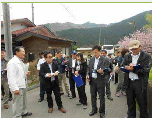
Survey in the village to identify resources and issues

(3) Vision development for “Better Village” & action plan for improvement