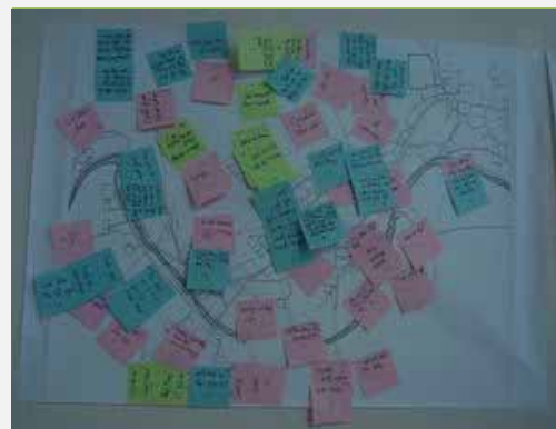
Mapping and Situation Analysis