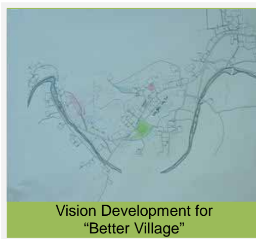
Vision Development for “Better Village”