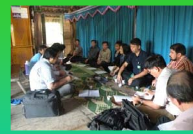
Importance of dialogues with the people