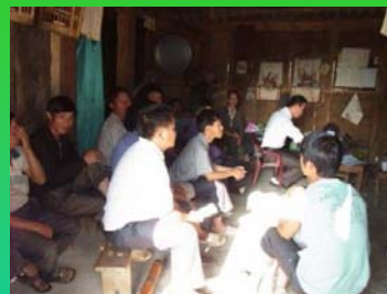
Technical training on livestock raising