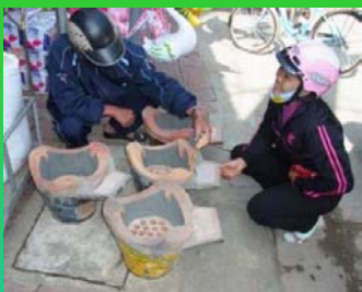
Introduction of improved stoves

The implementation of farmers' pilot activities is planned to be supported through the capacity development of the counterparts. In order to ensure sustainability after completion of the Project, SUSFORM-NOW (LDC) experts will not be directly involved in guiding the farmers. Instead, the implementation of pilot activities by the farmers will be primarily supported through the technical guidance of District and Commune People's Committee staff members under the guidance and instructions of the counterparts at PPMU and C/D PMUs.