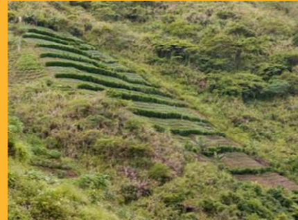
Proposal for contour line plantation

Importance of three well-balanced core principles of LDC