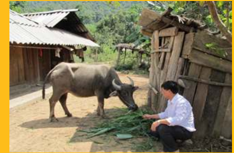
Proposed fodder cultivation and livestock raising