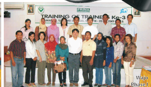
Wajo Phase I