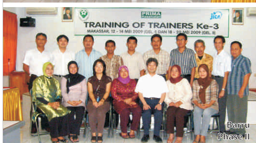
Barru Phase II