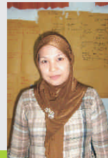
Sukmawati Village Midwife Tellumpunua Village, Puskesmas Pekkae, Barru

"We have to keep the principles in implementing this training, which are planning, implementation, evaluation and reporting"