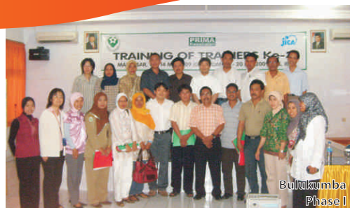
Bulukumba Phase I