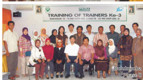
Bulukumba Phase II