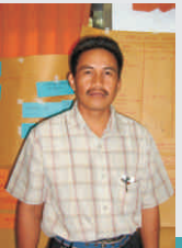
Jusman Health Environment Staff Puskesmas Palakka Barru

"This training module is easy to understand, simply by practicing what have been learned in it"