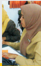
Indo Asse, SKM Surveillance Suplementer Puskesmas of Maniangpajo, Wajo

"The content of this training is very efficient and interesting for a simple planning. The training method is enjoyable, but serious. It is easy to understand"