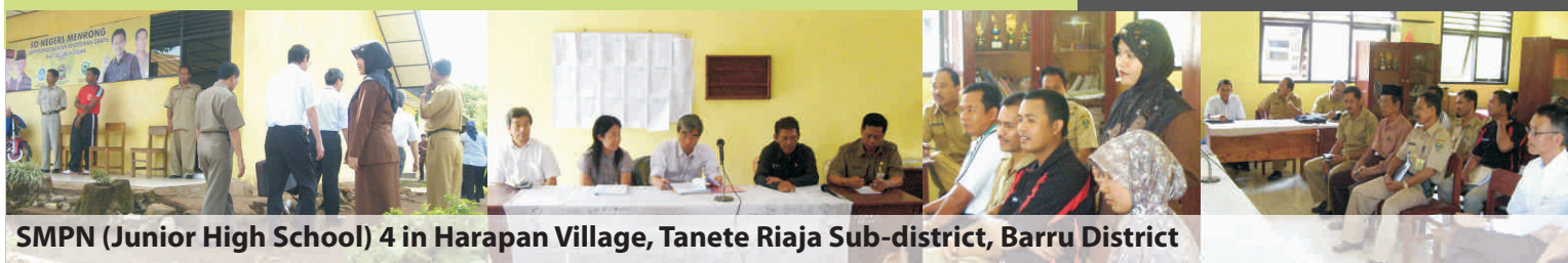
SMPN (Junior High School) 4 in Harapan Village, Tanete Riaja Sub-district, Barru District