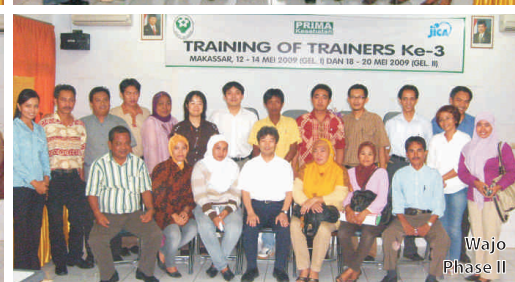
Wajo Phase II