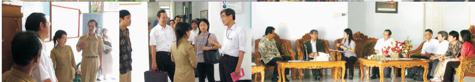
Puskesmas Lisu, Tanete Riaja Sub-district