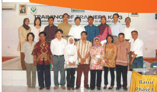
Barru Phase I