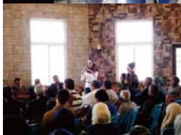
Kufur Kyfia April 25

The CHC members include the doctor who covers the VHC and nurses from a neighboring comprehensive health center. They collaborated in organizing the event. All community stakeholders are always committed well to implement the project activities (52 participants).