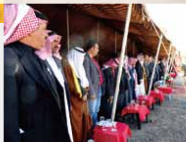
Al-Aqeb May 4

The CHC members conducted a health promotion activity to raise awareness of the hypertension and hyperglycemia screening program. The village leasers and the health promotor had rich experiences and great resources in the health promotion field (66 participants).