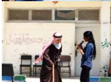
Abu Habeel April 25

The CHC members were highly committed since they joined the project workshop. Many traditional male community leaders joined the event and stressed their health issues, such as shortage of health services and health staff in their communities (76 participants).