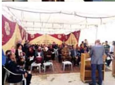
Al-Daqmasah April 26

The ceremony was carried out at the girl's school. The CHC members prepared a slide-show about the project activities. Two representatives from the JICA office joined and expressed their gratitude for active community involvement (100 participants).