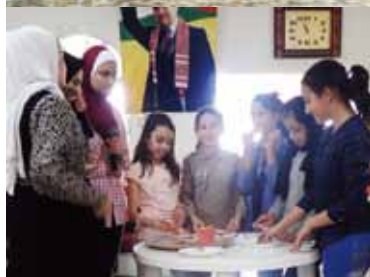
Al-Khribeh May 10

The event took place in the VHC's waiting space which was nicely decorated by the CHC members. Paying respect to specific to local culture, most participants were male. A community leader delivered a welcome speech and promised to support to improve the VHC environment (41 participants).