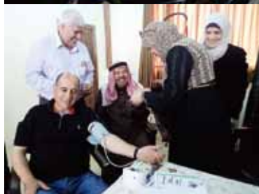
Mandah May 1

The ceremony took place under a tent and was led by one of the community members. Most participants were male due to the community's culture, and each one of them has a specific responsibility in the event. The district MCH supervisor made a speech on VHC roles (56 participants).