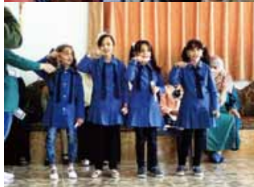
Tokobol and Om Al-Jadail May 4

The ceremony was held under the tent near the VHC. The director of the Mafrq Health Directorate joined the event and listened to community people's requests for enhancement of health facilities in their community. The CHC members helped each other (56 participants).