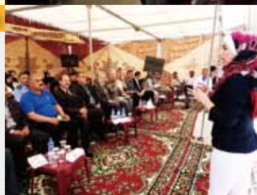
Breiqa May 9

The CHC members prepared various kinds of slides-shows and children's plays about nutrition and harm of secondhand smoke. The photo (left) shows their handmade food sample used for the children's play. A great level of commitment was observed from all stakeholders (86 participants).