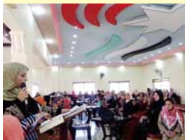
Ass'arah May 2

The VHC midwife and the CHC members collaborated well in organizing the event. Many female community members and school girls participated. The girls presented well-trained plays about RH services and nutrition songs (75 participants).