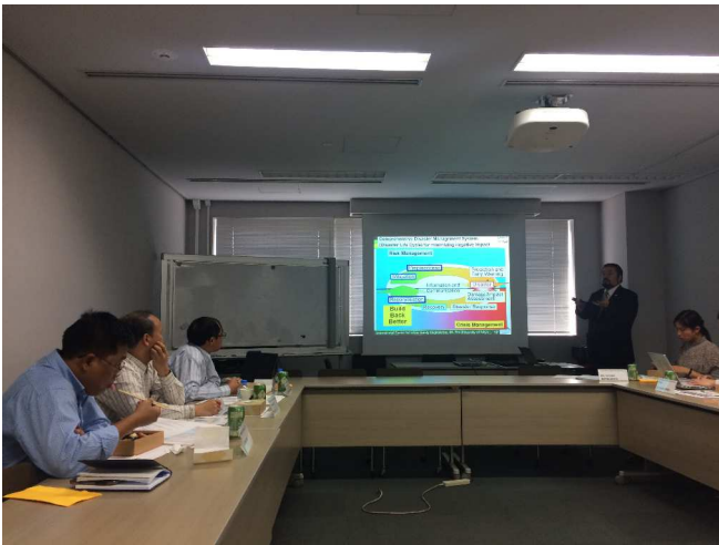
Meeting at U Tokyo (Mar.)

Both Myanmar and Japan side discussed about current situations and issues of the Project, and agreed to enhance project activities.