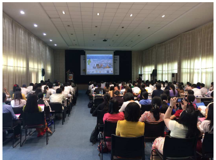
Infrastructure seminar at YTU (Mar.)

Over 160 participants from MOC, Private companies, YTU and so on attended on seminar and shared current situation and future efficient maintenance practices for proper infrastructure management.