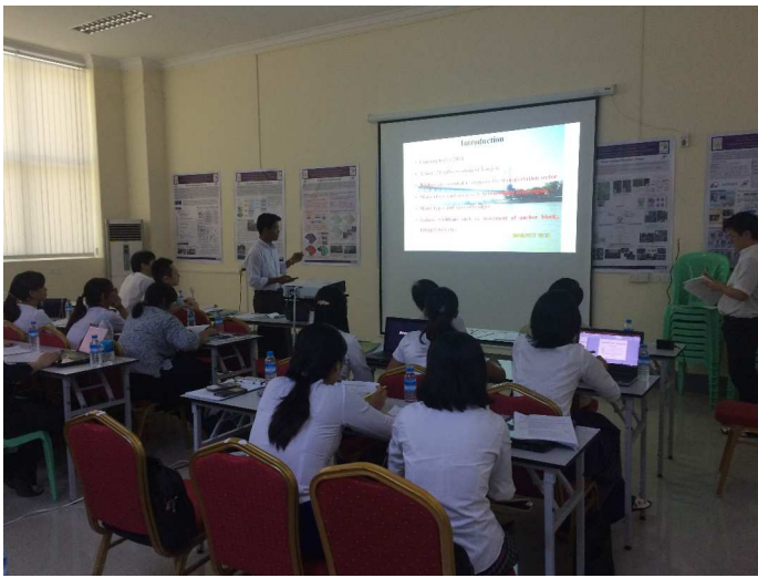
Myanmar-Japan Joint Seminar (Feb.)

Main aim of this seminar is to improvement of student's presentation skills and teaching skills of YTU faculty members. It is also expected that sharing progresses on project related activities will contribute to enhance improvement of their research activities.