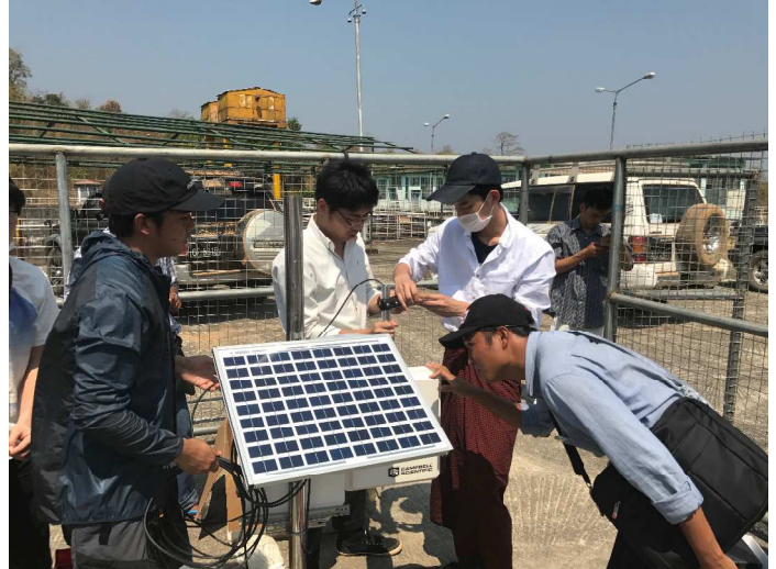
Installation of weather station at Zaung Tu Dam(Mar.)

Observation data has been transferred to YTU by telemetry system.