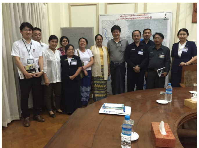
Meeting with the Secretary and concerning Departments at YCDC