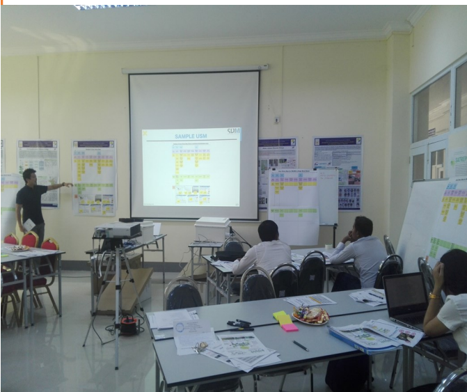
Equipment Training Workshop

Water related disaster group held equipment training workshop for establishing Bago river basin telemetry at SATREPS Office, YTU. The officers from DWIR, DHPI, DMH