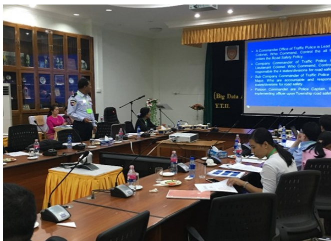
Presentation from Traffic Police Department