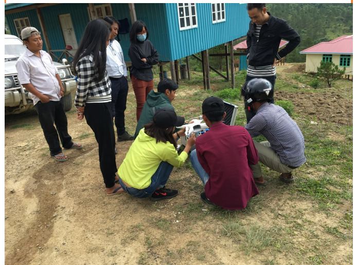
Using drone to check the land use

Disaster Management Group went to Hakha City in Chin state to survey land sliding. They also met and discussed with Fire Force, Redcross and local organizations. They also conducted "LANDSLIDE DISASTER MANAGEMENT WORKSHOP" in Hakha Township assembly hall on 18th May 2018.