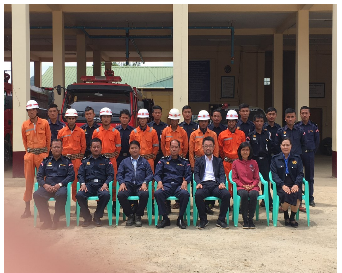
Group photo with Fire Force of Hakha City