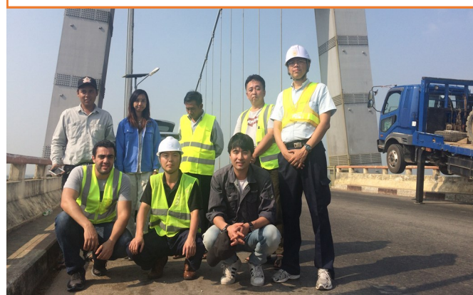
Infrastructure Group Photo

Infrastructure Group of SATREPS Project went to Twantay bridge to install new inclinometer and transducer. They collected data from previous installed inclinometer and transducer.