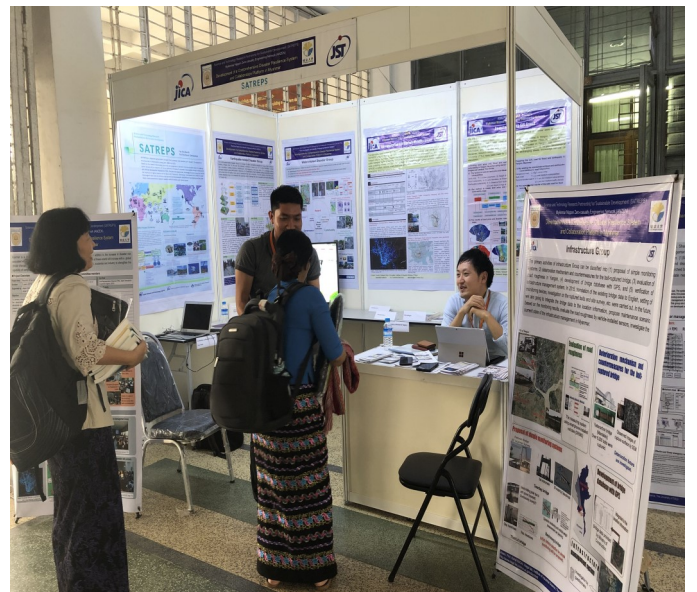
Exhibition Booth of SATREPS Project