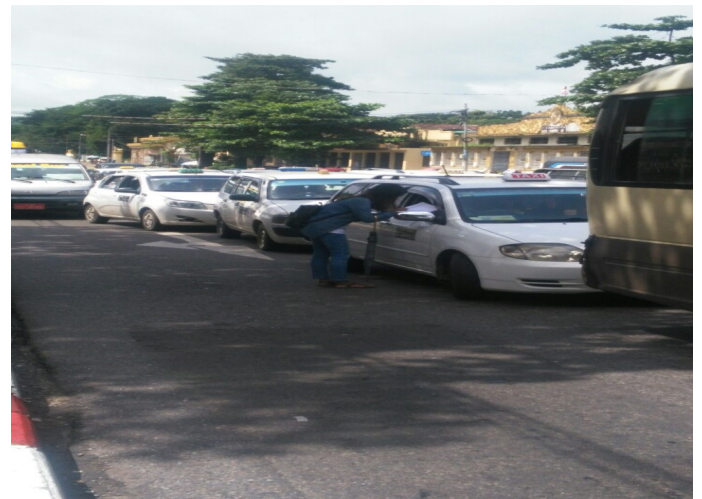
Surveying around Yangon City by using GPS

Transportation and Human Mobility Group visited around the city of Yangon to count the number of passengers by using GPS.