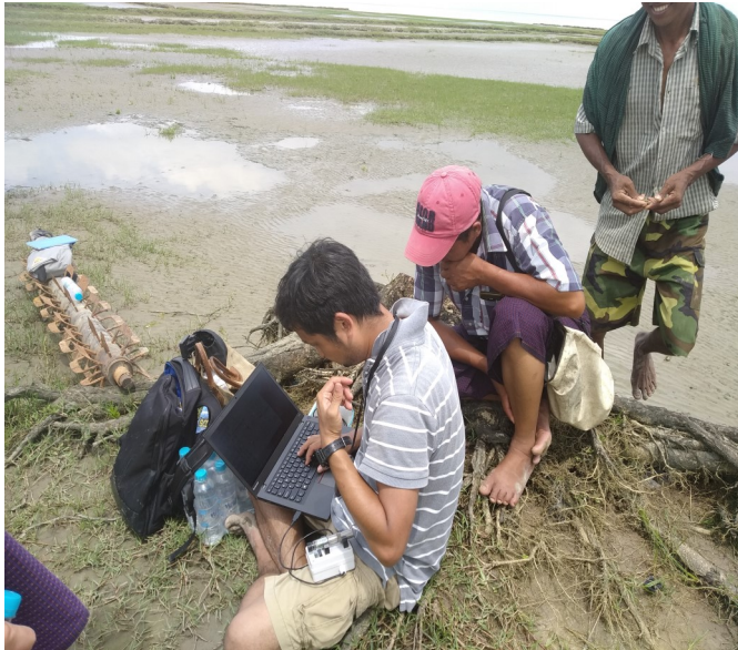
Preparation of pressure sensor which is to be installed in the river

Water Related Disaster Group visited to Sittaung River to observe the tidal bore which is assumed to be related with flooding in Bago city.