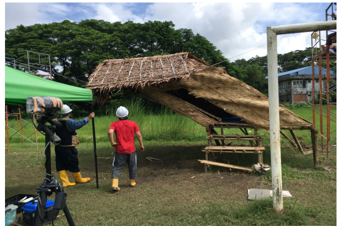
Pull down testing of Bamboo structured house

Earthquake Related Disaster Group made a Pull down test in YTU soccer field for Bamboo structured house and Timbered structured house which are common types of houses in slum areas of Yangon.