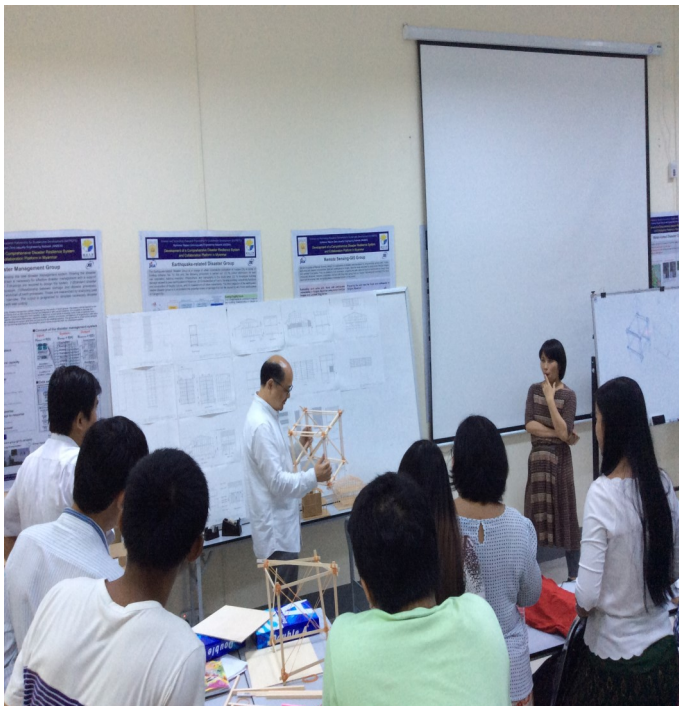
Demonstration of the earthquake resistance of timber structure