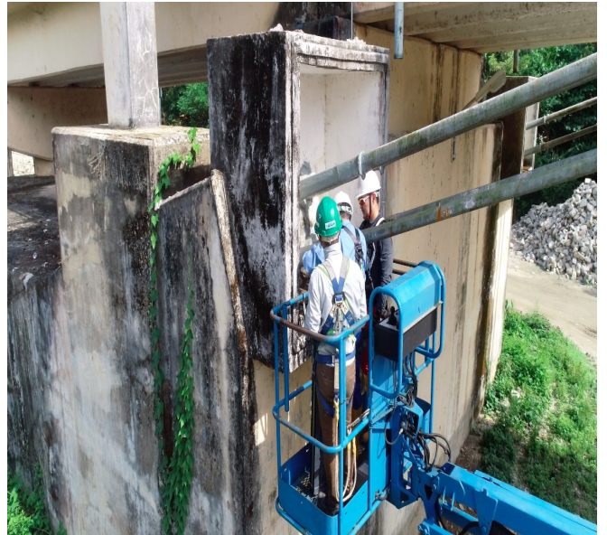
Inspection of anchorage condition in Shwe Laung Bridge

Infrastructure Group visited to Shwe Laung Bridge and Panmawady Bridge in Ayeyarwady Region to inspect the conditions of bridges.