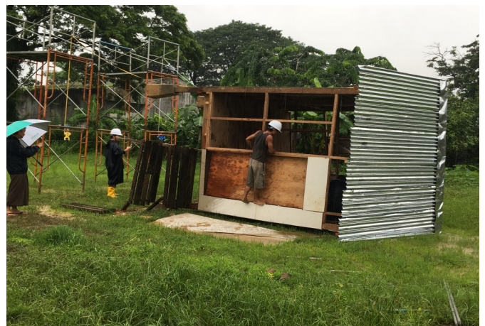
Pull down testing of timbered structure house