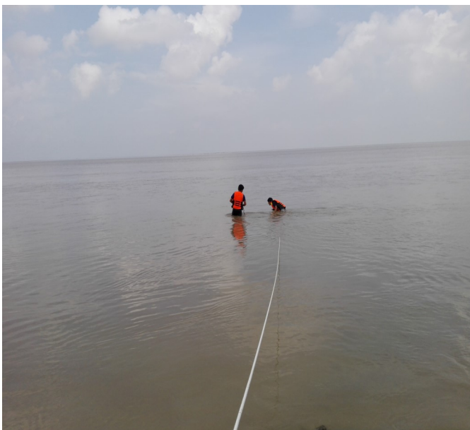
Installation of pressure sensor in the river before coming tidal bore