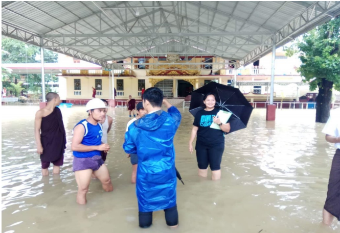
Questionnaire survey to local people during inundation

Bago city faces severe flooding annually during the rainy season. Water Related Disaster Group visited to Bago flooded area and conducted questionnaire survey among local people and investigated the propagation of flood during inundation.