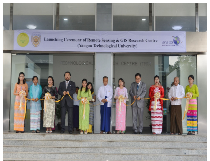
Launching Ceremony of Remote Sensing & GIS Research Centre

As one of the achievement of SATREPS Project, Remote Sensing & GIS Research Centre was officially launched in Yangon Technological University.