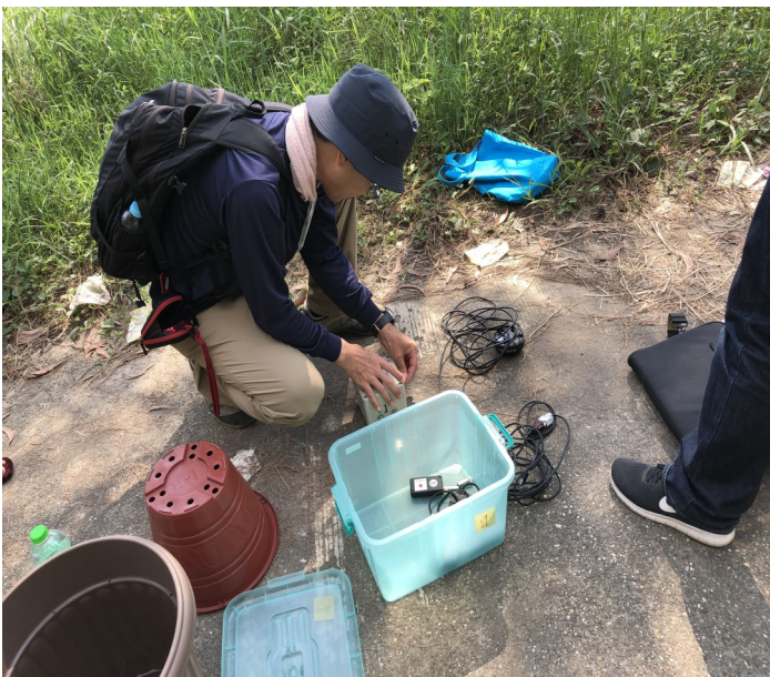
Microtremor surveying around Yangon city