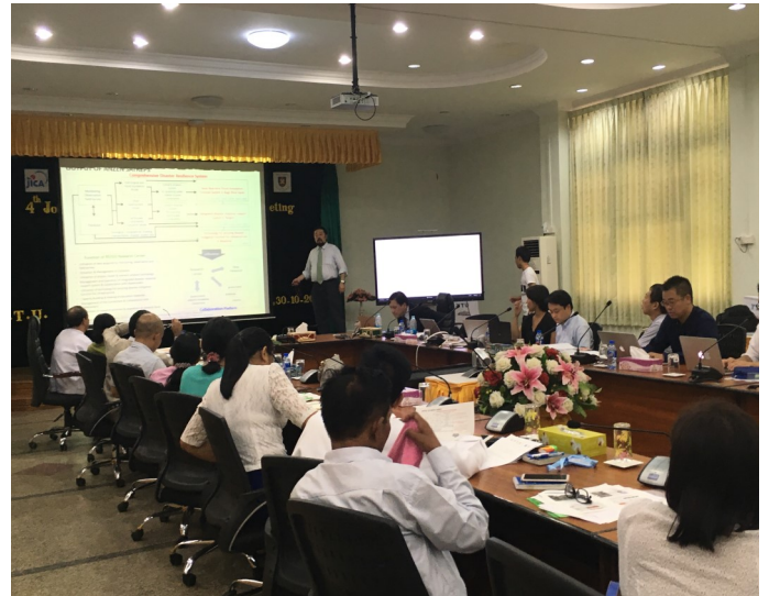
4th JCC Meeting

4th Joint Coordination Committee (JCC) Meeting of SATREPS Project was held in Yangon Technological University. The previous achievement, progress of the project and future activities are explained by each group leader.