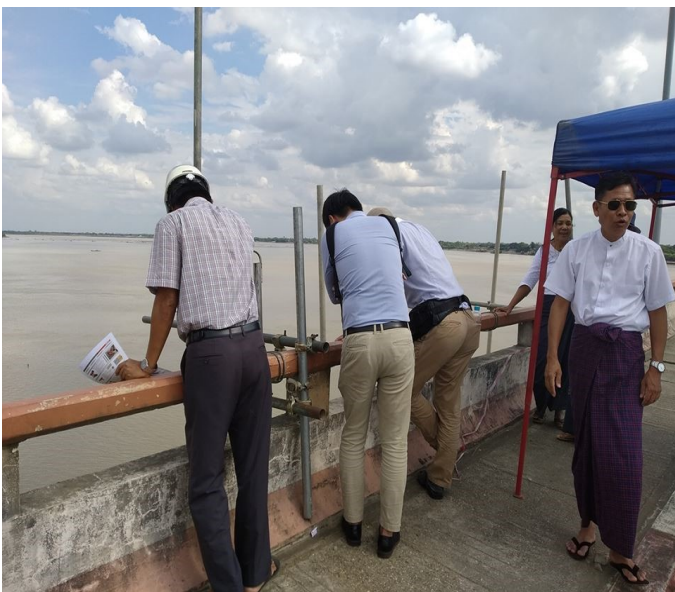
Checking the progress of construction of Automatic water Level Station at Kakawe Bridge

Water Related Disaster Group visited to Kalawe Bridge to check the progress of the construction of structure for the Automatic Water Level Station which is intended to be installed in January 2019.