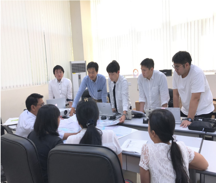
Group Discussion before microtremor survey

Earthquake Related Disaster Group visited many townships of Yangon city and made microtremor survey