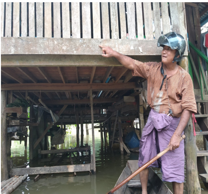
Showing the maximum water level of this year during severe flooding by local boat man