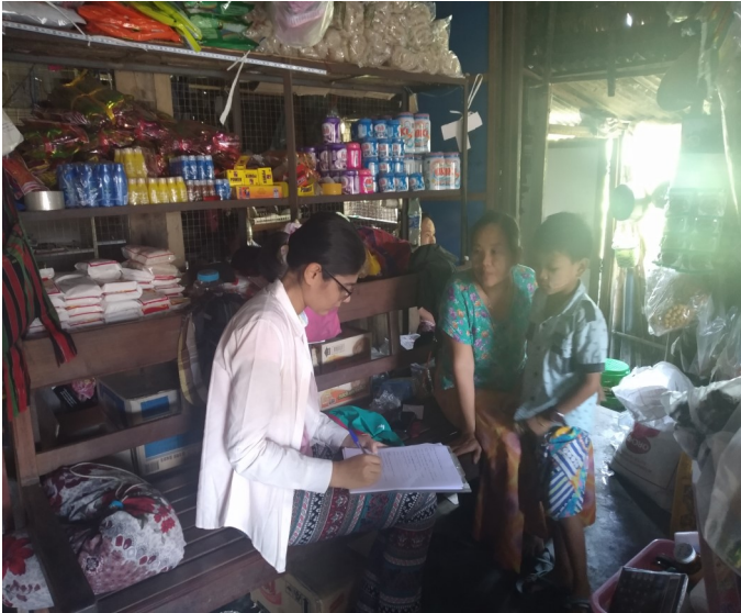
Questionnaire survey to local housewife about her household conditions

Earthquake Related Disaster Group visited to slum area in Hlaing Thar Yar Township of Yangon to understand the actual standard of living condition of local people and to investigate their household conditions.