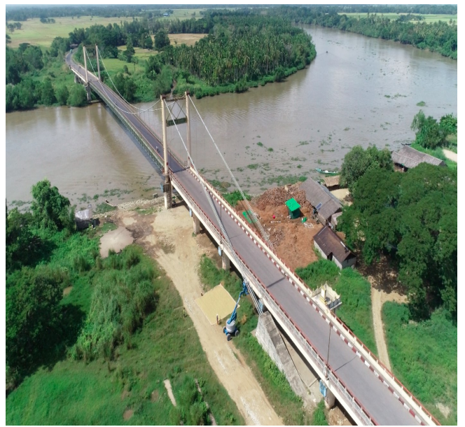
Overview of Panmawady Bridge and working area