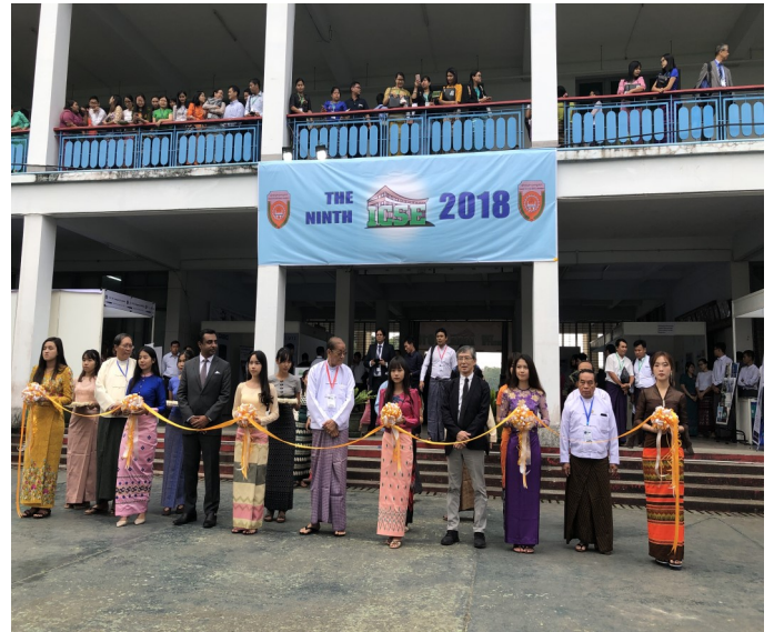
Opening Ceremony of 9th International Conference on Science and Engineering

Project members of both YTU and Japan side submitted 10 papers to 9th International Conference on Science and Engineering (ICSE) which was held on 8-9 December 2018 at YTU.