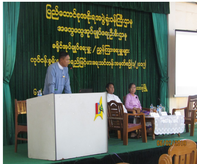
Speech by officer from Government Administration Department

Disaster Management group conducted first workshop for Disaster Risk Reduction Training at Government Administration Department (Mingalardon)