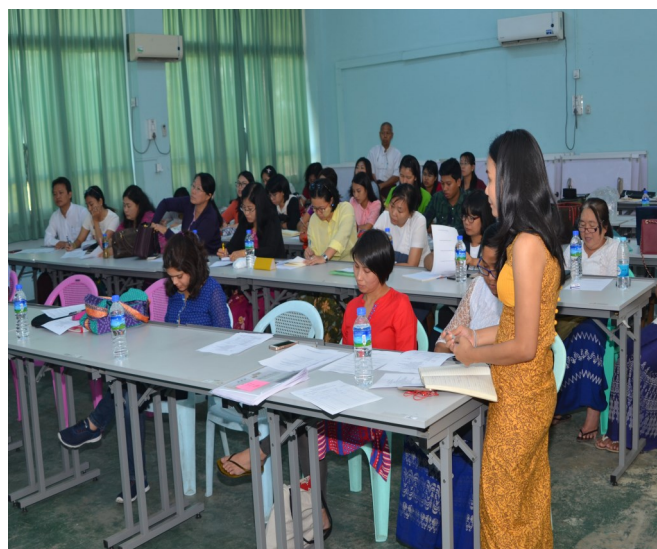
Urban Planning Workshop at Yangon Technological University

Earthquake Related Disaster Group conducted workshop in Yangon Technological University and Yangon City Development Committee.