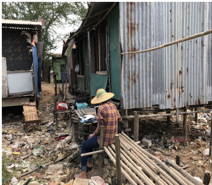
Field survey at slum area of Yangon

Earthquake Related Disaster Group went to slum area of Yangon (Dagon Seikkan Township) to collect the required data for the preparation of second Pull Down Test.