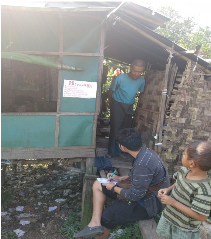
Flood Survey in slum area of Bago City