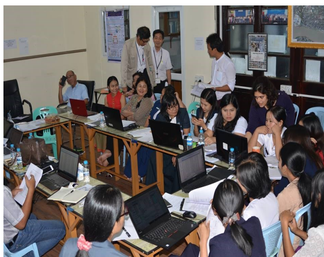
Urban Planning Workshop at Yangon City Development Committee