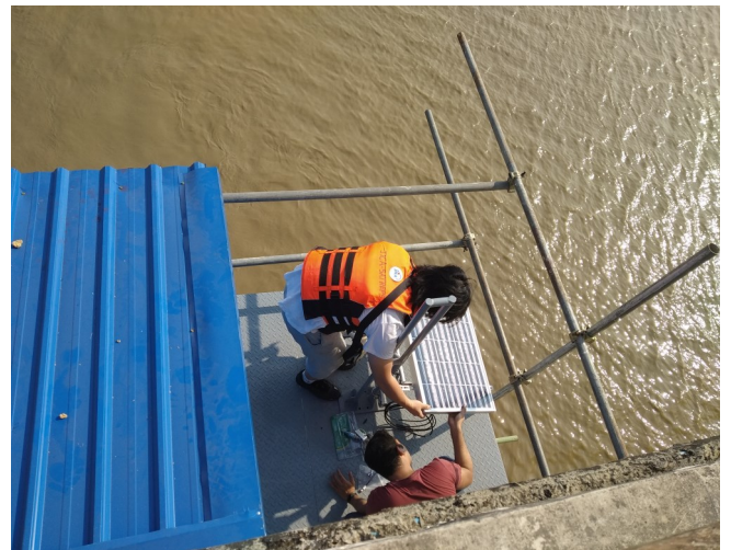
Preparation for the setting of solar panel

Water Related Disaster Group has to installed 3 AHS in Bago River Basin. The group already installed first AHS in Tarwa Sluice Gate. They installed second AHS at Yangon-Thanlyin No.2 Bridge (Kalawe Bridge) with the support of Department of Bridge and Department of Water Resources and Improvement of River Systems to get the required water level data. AHS included two types of sensors 1. Floating Type 2. Rader Type