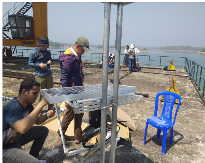
Preparation to install Automatic Hydrologic Station (AHS) at Zaung Tu Dam

Water Related Disaster Group installed last AHS at Zaung Tu Dam with the support of Department of Hydropower Implementation. The group also visited to Zaung Tu Weir to maintain Automatic Weather Station (AWS).