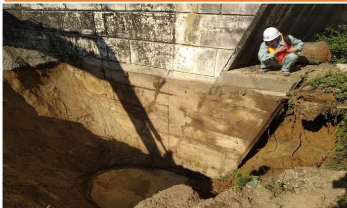
Excavation work to check the pile cap condition

Infrastructure Group inspected Twantay and Patheingyi Suspension Bridge together with Japan Ministry of Construction and Nippon Koei Company Limited. The Group also collected the data from the inclinometers that installed in the towers and transducers under the deck.