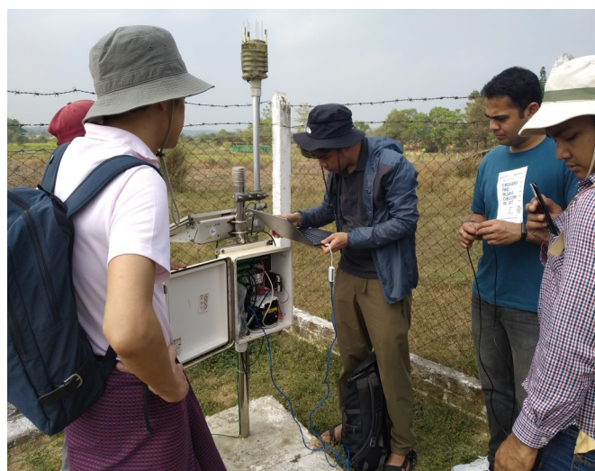
Maintenance and solving data transmission problem at Automatic Weather Station (AWS) at Zaung Tu Weir