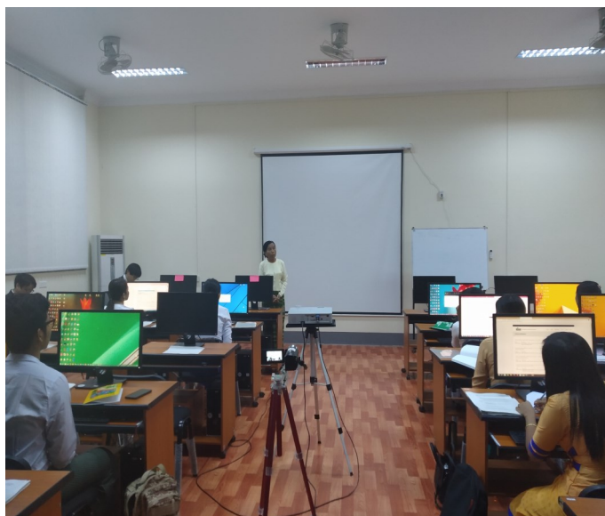
Opening Speech by Pro Rector in DIAS Training

Water Related Disaster Group together with International Centre for Water Hazard and Risk Management (ICHARM) conducted Data Integration and Analysis System (DIAS) Training at Yangon Technological University.