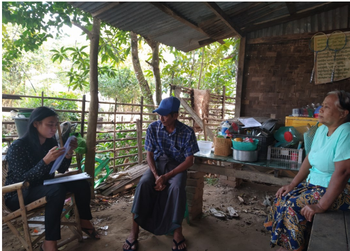
Flood survey around Bago City

YTU students from Water Related Disaster Group went to Bago city to collect the required data for the assessment of house damage during 2018 flood.