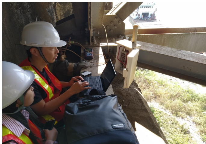
Data collection from Inclinometer and Displacement Transducer