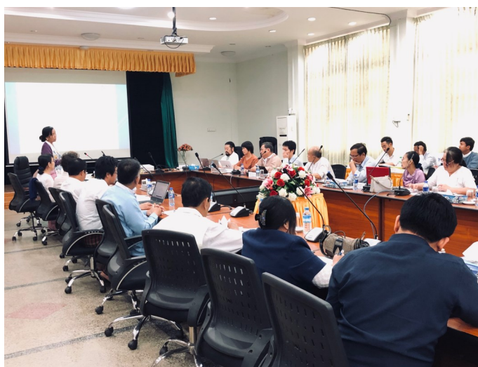
Discussion for future collaboration

Consortium Preparation Meeting was conducted for the future collaboration between government, institutions and private sectors.