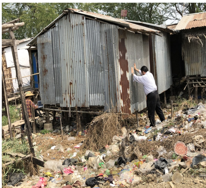
Checking the house condition in slum area of Yangon