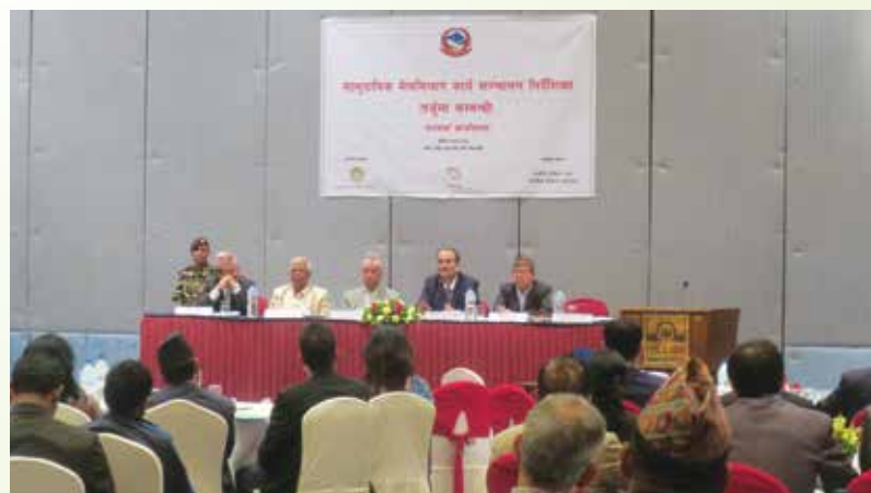
Seminar on formation of community mediation guidelines

The ministry will shortly incorporate the relevant suggestions and finalize the guidelines for approval.