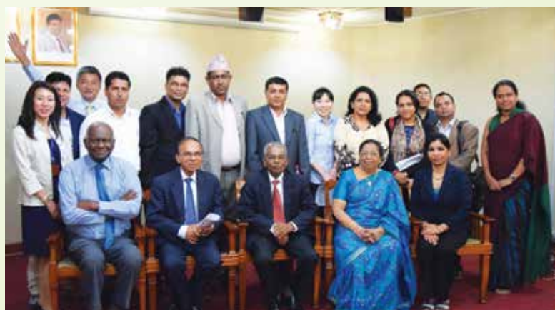
Nepali visit team with Officials of Sri Lanka

The team members shared, this exposure on community mediation in Sri Lanka will be helpful to formulate community mediation policy and in implementation of community mediation all over Nepal.