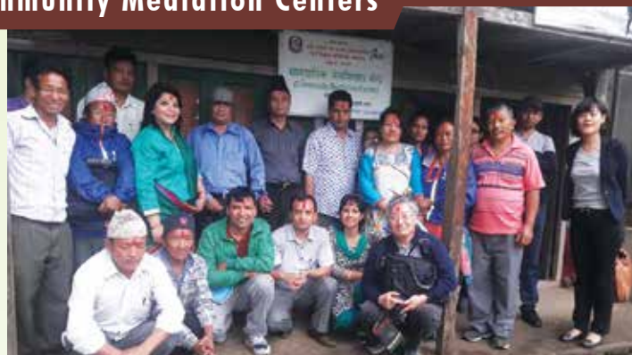
Joint monitoring team in Bhadrakali VDC, Sindhuli