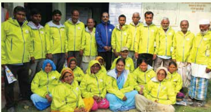
Community mediators in Jackets supported from MontBell

JICA COMCAP - II organized review of community mediation implementation in COMCAP supported VDCs and certain wards of recently formed municipalities in Mahottari district from 24 February to 4 March, 2016. In the programme, the mediators' jackets sponsored by MontBell Company were handed over to the Community Mediators. A one-day programme was organized in each and every COMCAP implemented VDCs and wards of the municipalities. Same programme was organized in VDCs of Sindhuli during December, 2015.