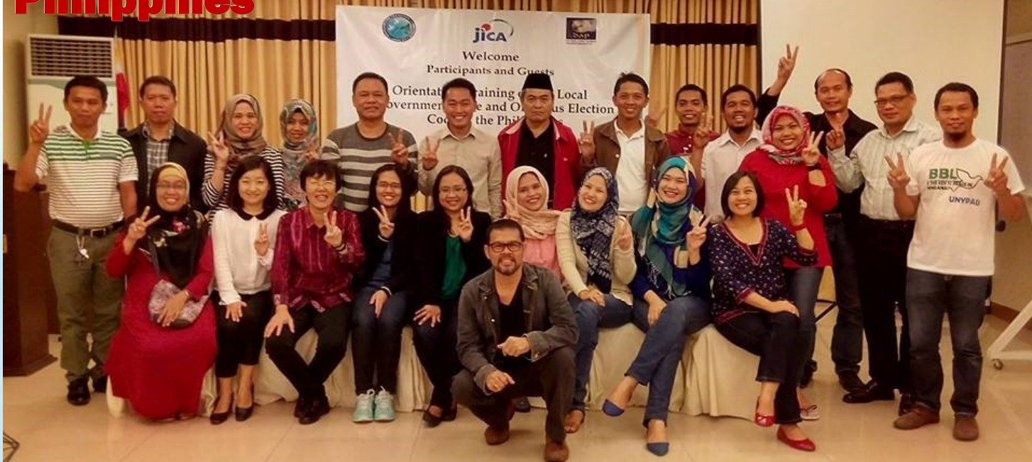
The participants in the preparatory orientation training on Local Government Code and Omnibus Election Code of the Philippines from the Office of the Presidential Adviser on the Peace Process (OPAPP), Bangsamoro Transition Commission (BTC), Japan International Cooperation Agency (JICA) and the Moro Islamic Liberation Front (MLF) working together towards a meaningful governance in the future Bangsamoro government.

The Institutional Organizational Building (IOB) component of the CCDP-B hosted preparatory session and orientation training for the “Bangsamoro Code Study Mission in Japan” in partnership with Japan International Cooperation Agency (JICA) and the Bangsamoro Transition Commission (BTC) held at the Pinnacle Hotel and Suites, Davao City on June 22-24, 2015.