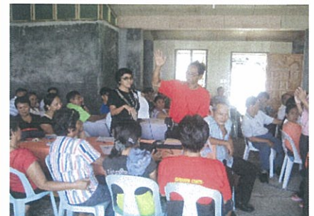
Meeting at Caibiran Municipality, Biliran

All of the Woman's Health Teams were actively conducting their safe motherhood promotion activities in all municipalities covered by the project. Addition to WHT, Municipality now make emergency properness systems with in municipality to support community