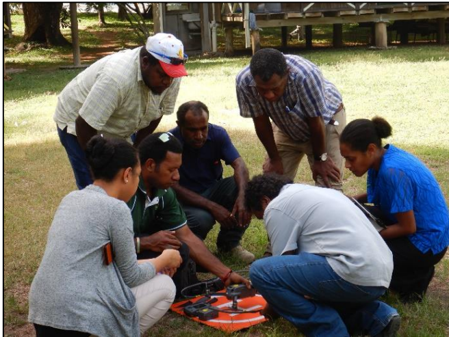
Fig.7: PNGFA officers learning how to properly assemble and dismantle the drone.