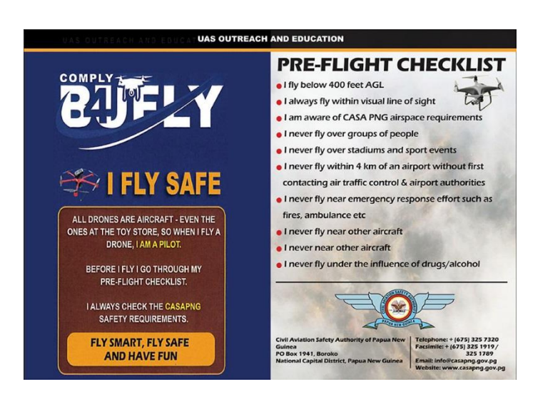
Fig.8: The Pre-flight Checklist published by CASA PNG