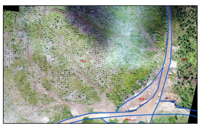
Fig.12: Orthophoto to be used for updating Plantation Inventory (overlayed over existing information)