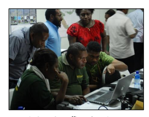
Fig.2: PNGFA officers learning to process the drone-captured images