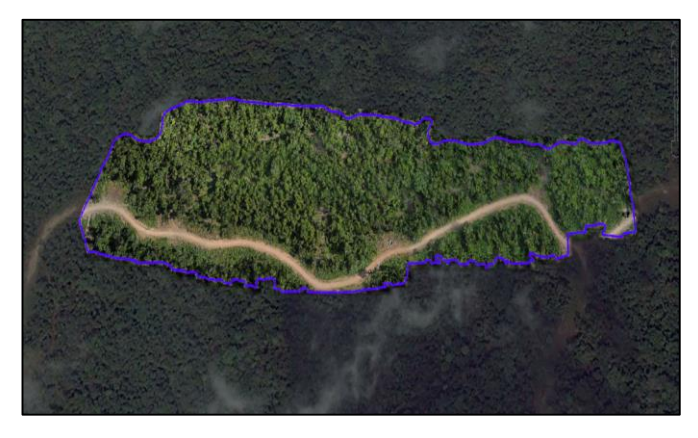
Fig.11: Orthophoto to be used for Inspection of Natural Forests (overlayed in Google Earth)