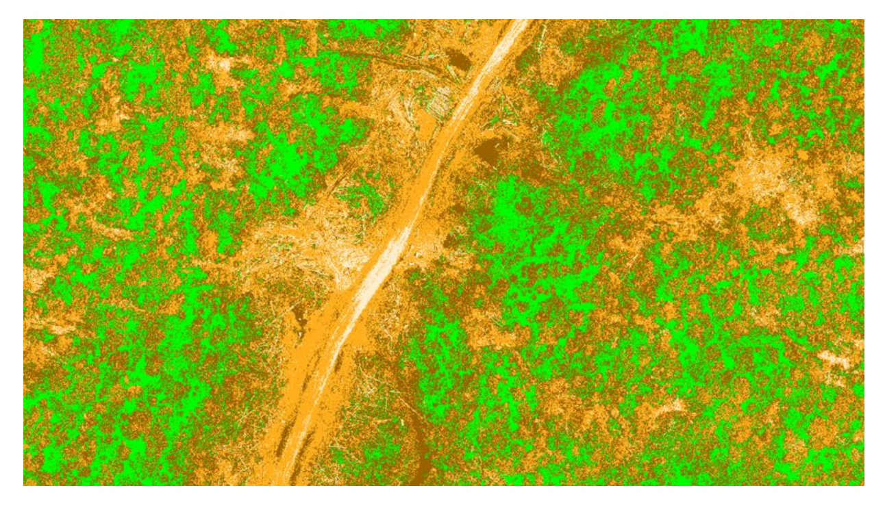
Fig. 13: The calculated aerial imagery showing the areas of degradation in orange and vegetation in green.

The final result is the percentage of felling areas and skid trails that make up the degradation of the forest area.