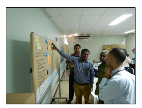
Fig.4: JICA experts and PNGFA officers discussing the applications of drones in forest monitoring.