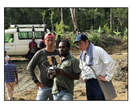
Fig.5: PNGFA officers and JICA experts monitoring an automated flight plan being executed by the drone.