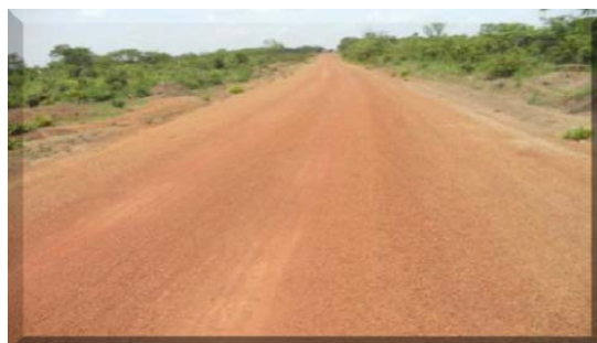
Gbonsamba to Makonday Feeder road – Lot 1 after Rehabilitation in Port Loko District.