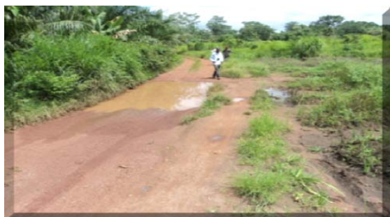
Gbonsamba to Makonday Feeder road – Lot 1 Before Rehabilitation in Port Loko District.