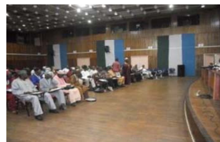
Picture: District/Rural Development Forum held in Freetown, 26 th May, 2011.