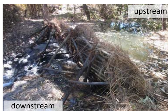
The constructed simple weir at Mufuchani camp(2). This is the trigonal type weir which is selected to suit the site's ground condition. After that, Farmers will dig the furrows to their target fields.