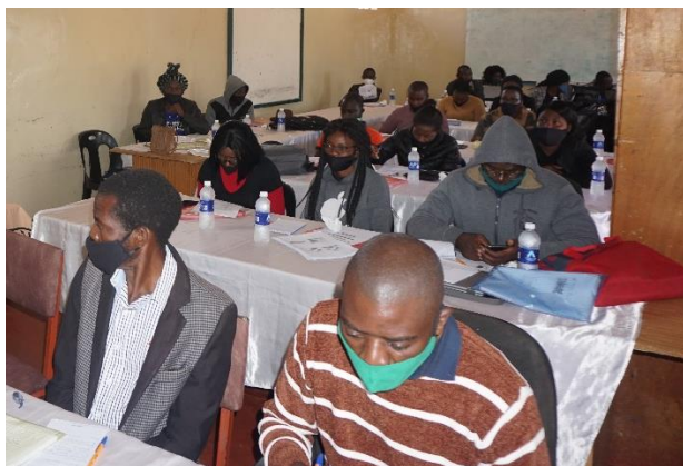
Participants wearing surgical mask in Mansa Farm Institute.

Main topics of the training were; 1) Cultivation techniques & Farm management, 2) Water Management, Farmers' Organization and Gender, 3) Nutrition Improvement and 4) COVID-19 Impact Analysis. The JICA project team also observed the training by Video from Japan. Although the video was sometimes not clear and the internet was lagging, the team remotely monitored the training from Japan.