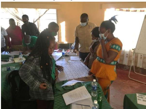
Group work on Nutrition improvement in Northern Province

· Nutrition Improvement needed more time than allocated, the module couldn't be completed on the same day as such it was deferred to the next day. The activities were very interactive especially the Nutrition Improvement part, however, trainees requested that practical activities such as cooking demonstrations of nutritious foods, preservation. Simple activities on Nutrition be incorporated on the entry planning for camp and district. Nutrition training be moved and to follow after SHEP training as the two complement each other in on-farm irrigation. That aspects of nutrition should be considered during cropping calendar alongside marketing (Luapula)