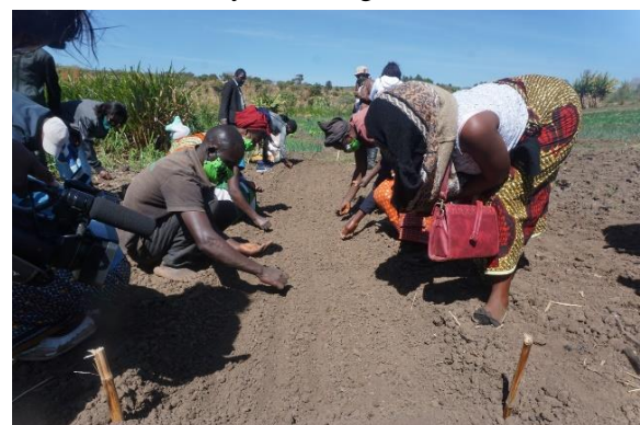
Officer and farmers conduct practice of nursery bed making in Muchinga province

- Trainees: the contents were well presented and understood. There was no ready-made bokashi seed and the trainers had to make the seed on site at FTC. In the future need to make bokashi seed upfront. Due to limitation of allowed contact time, the team visited the core site at Chalwe and not the District Model Site which is 50km away (Muchinga).