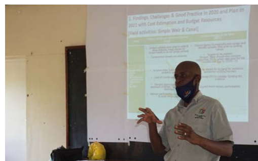
Mr. Sampule (SIE of Copperbelt province) explains the results of monitoring and activities of CPUs. (1st Batch)