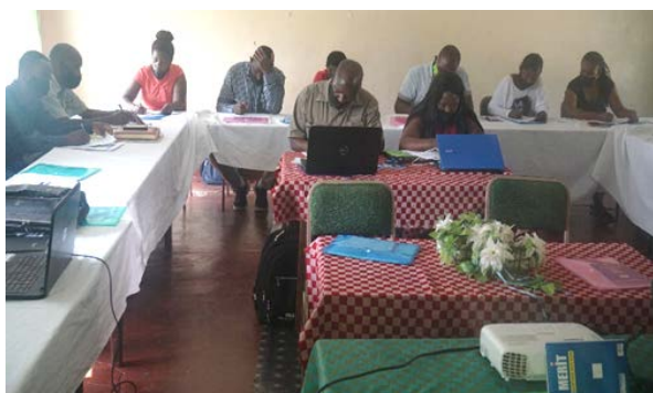
Participants take notes in the feedback session from the CPU. (Central province)

There are some cases in which the technology and knowledge of COBSI have not been disseminated adequately to farmers and CEOs. The project will feature the District Model Sites next year for good dissemination of the COBSI advantages to the wider area and community farmers.