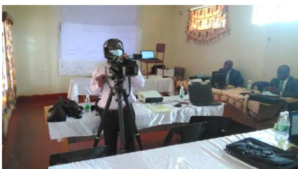
The NAIS officer also participate at AEW and shoot the presentations and discussions. (Luapula province (1st Batch))