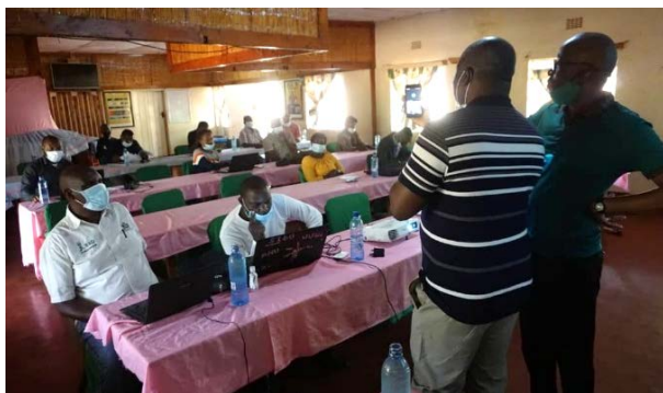
Participants wearing surgical mask in MAFF Site Mpika (Muchinga Province (1st Batch))

The JICA project team participated in the AEW from Japan. The online system was sometimes not clear and the internet was quite slow just as during the MTT. However, the presentation data and the photos of the flip chart which they prepared were sent to the Japanese experts through e-mail before each presentation, so the experts could contribute through questions and comments to the presenter while looking at the data.