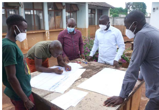
Participants from Mushindamo district write the results and lessons learned of E-COBSI activities on the Philip Chart. (Northwestern Province (1st Batch))