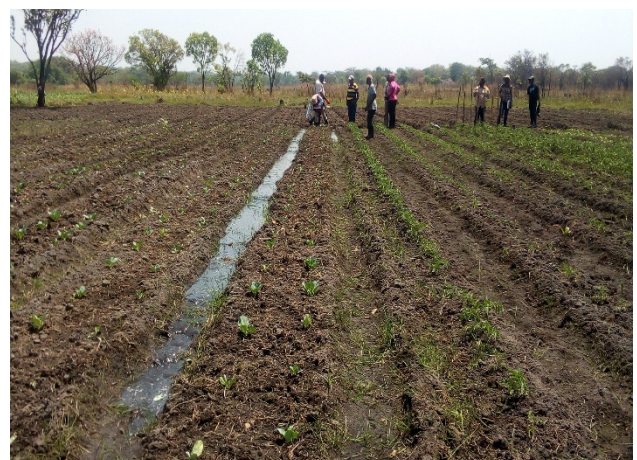
Water flowing by gravity in a Cabbage demonstration plot at Kapimbe district model site in Mufulira district