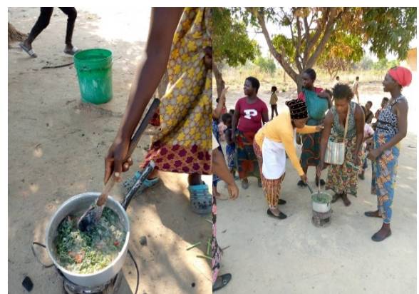
Nutritionist from Luanshya district conducting cooking demonstration at Funkutu Site

In the month of September, the district team conducted cookery and vegetable preservation trainings at Funkutu site. Farmers were trained how to prepare pumpkin leaves (Chibwabwa) with groundnuts and preservation of vegetables like; Chinese Cabbage and Rape