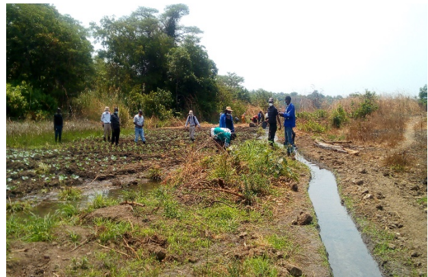
Canal delivering water to a crop demonstration plot at Buni district model site in Mpongwe district