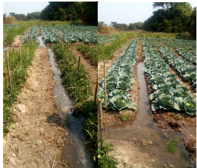
Water flowing by gravity in Tomato & Cabbage demonstration plots at Twalubuka district model site in Mufulira district