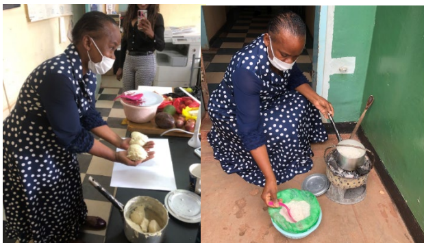
Team developing the hand scale for Zambia

by the Zambia Food-Based Dietary Guidelines (FBDGs) have been developed and they contain dietary and other recommendations for the Zambian Population. In order to tackle the problem of simple methods by which farmers can measure quantities of food to be consumed according to the daily recommended allowances of nutrients in the Zambia Food-Based Dietary Guidelines, a team of E-COBSI and Ministry of Agriculture staff met in Kasama to develop the Hand Scale for Serving Food using locally available foods. The Hand Scale method is adapted from the "Hand scale to serve food daily" developed by a Japanese company called Health Planning Aichi. ( http://www.foodmodel.com/category04/f_50.html ).