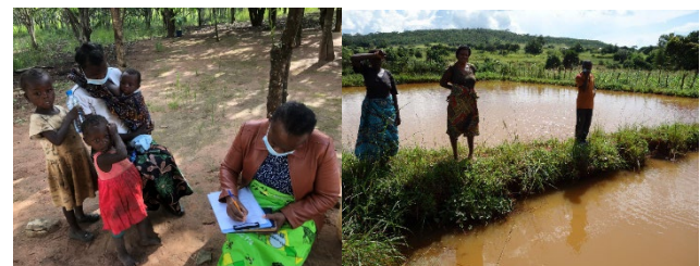
Nutrition narrative survey in individual fishpond in Mbala district Kasama district