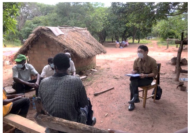
Farmer's interview in Kasama district of Northern province

follow-up way for each model site in this phase. Within this month, the project team visited 4 district model sites in the Northern province.