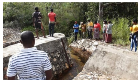
Musanda Irrigation Scheme in Kampanda Camp

CONTACT: ecobsi.zambia@gmail.com BACKNUMBER: https://www.jica.go.jp/project/zambia/020/newsletter/index.html (JAPANESE SITE)