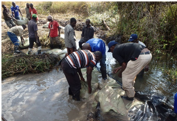
Farmers putting sandbags to make a temporary cofferdam (Mufulira District).