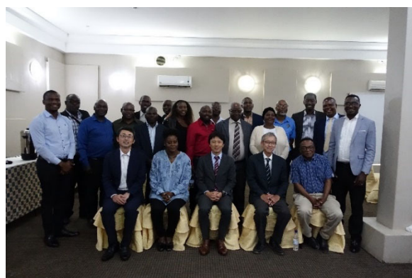
The participants of 5 th JCC meeting