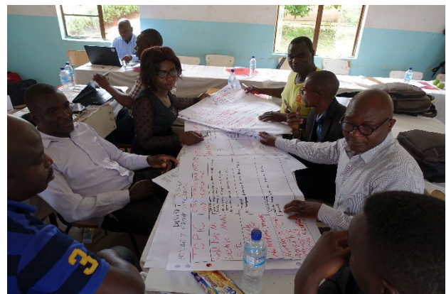
During the group works, challenges, counter measures, lessons learnt, etc. were discussed (North Western province).

As for the nutrition component, some CEOs highly evaluated a newly introduced tool “ Tebakari-Eiyouhou ” because it was easy for farmers to understand necessary amount of each food group. However, there were cases that farmers received a wrong message that they cannot eat more than the recommended amount though the amount is just a “standard requirement”. Thus, it is necessary to improve the manual or the training contents to convey the correct message to farmers.