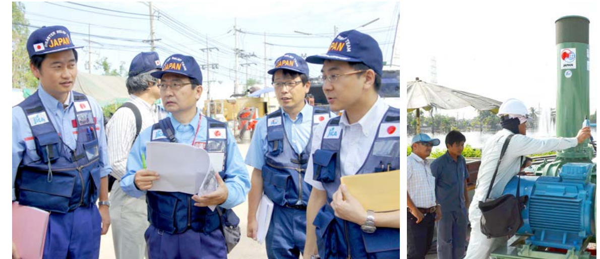
Japan Disaster Relief Team during Thailand's 2011 Flood

With the increasing awareness of the global community to mitigate climate change, which has an enormous negative impacts in the socio-economy and people, currently JICA focuses on tackling global issues such as air pollution, marine debris, and climate change, while also providing technical and academic cooperation support for Thailand to achieve its goal of Net-Zero Emissions.