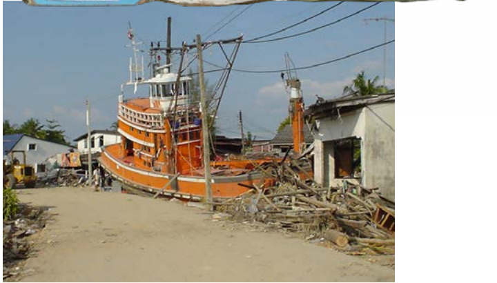
Japan Disaster Relief Team during 2004 Tsunami in Thailand