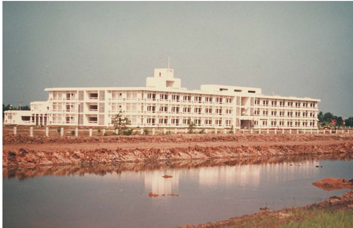
Environment Research and Training Center (ERTC) supported by Japanese Grant Aid, circa 1991

JICA responds to environmental issues, such as natural environment conservation, water resource management and supply, disaster risk reduction, and air pollution. Since the 1970s, JICA has been working with Thailand to restore the ecosystem and environment, which had been deteriorating due to rapid economic growth, posing a threat to the quality of life.