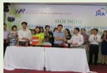
Signing MOUs between target groups and buyers