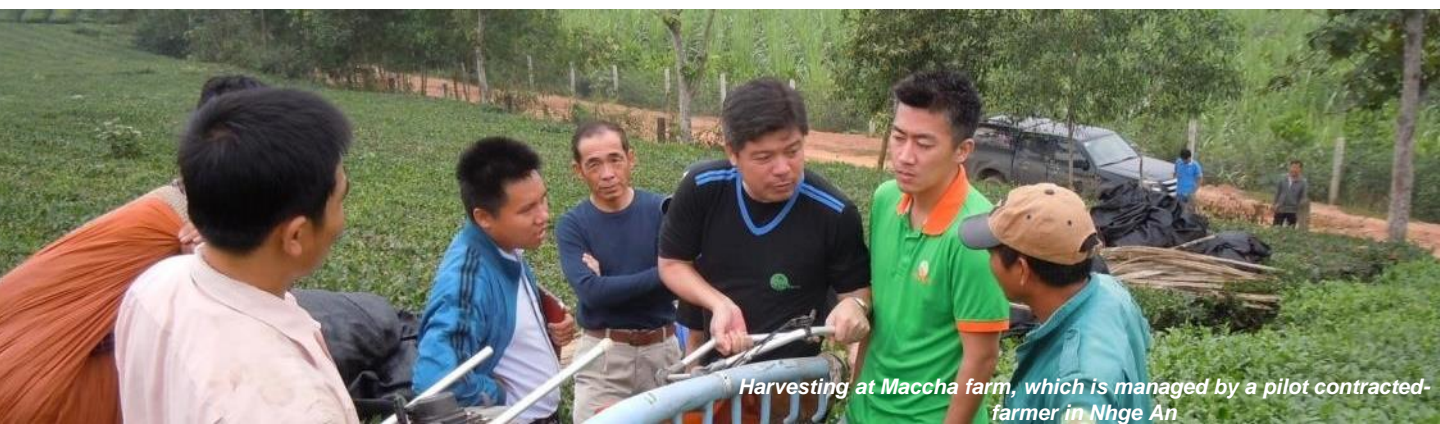
Harvesting at Maccha farm, which is managed by a pilot contracted-farmer in Nghe An

“Contract-based agricultural production which will be the model for the food value chain in Nghe An” (Nghe An Portal, 19/06/2016)