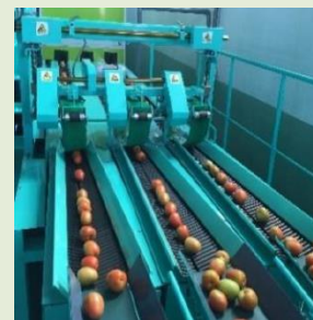
Right: Installed sorting/grading machine in operation