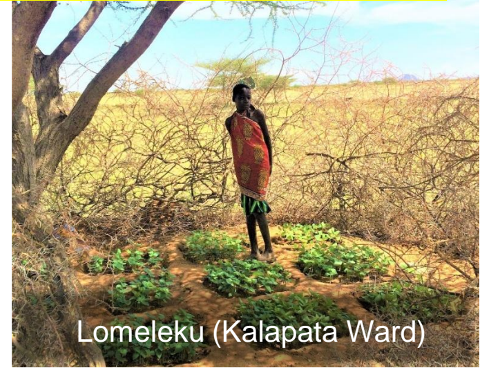
Lomeleku (Kalapata Ward)