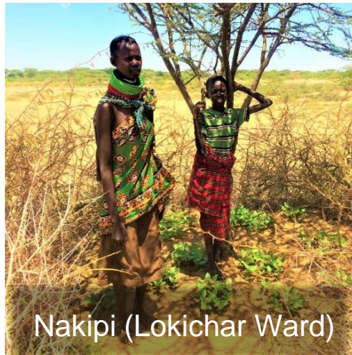
Nakipi (Lokichar Ward)