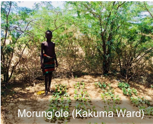
Morong'ole (Kakuma Ward)