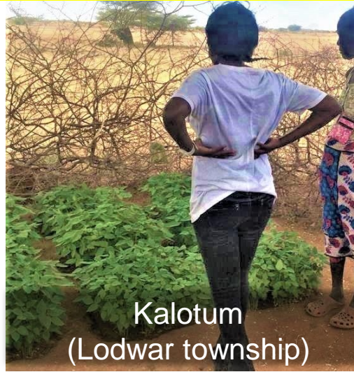
Kalotum (Lodwar township)