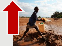
Water Insecurity and Health