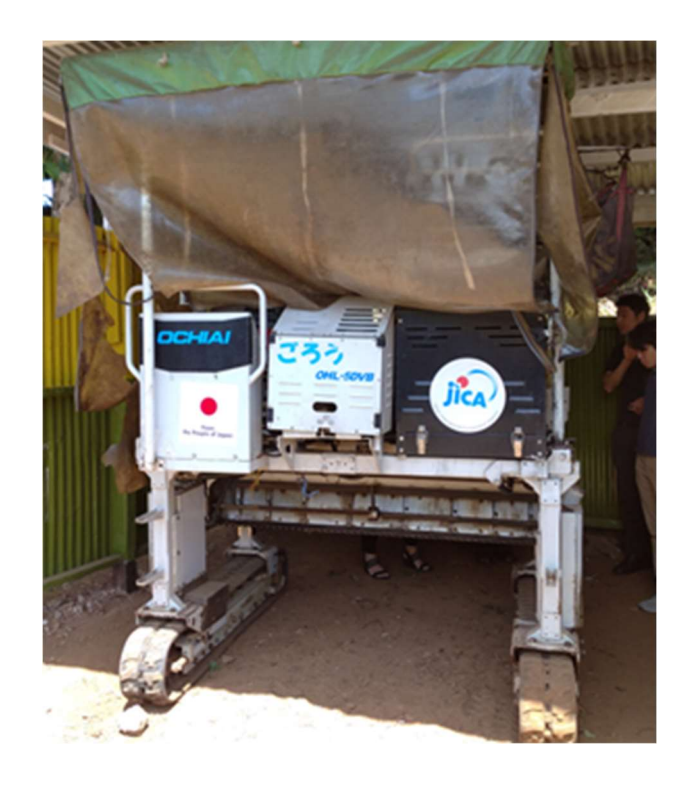
A riding type tea harvester by Ochiai