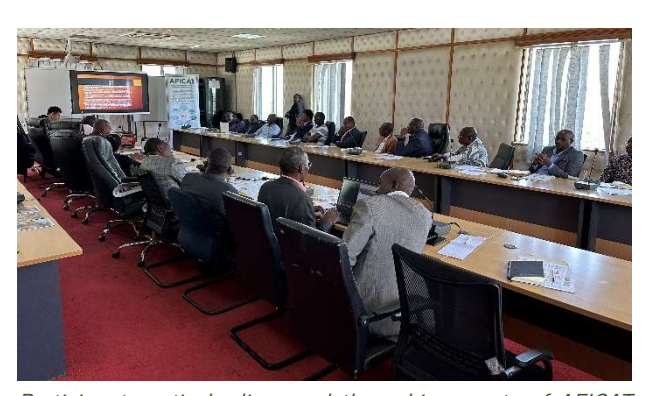
Participants actively discussed the achievements of AFICAT pilot phase activities and future actions to be taken.

During the pilot phase, AFICAT was implemented jointly by JICA and the Agricultural Engineering Services under the MoALD. The AFICAT team would like to express sincere gratitude to our main partner organization for their tremendous support in conducting field studies and activities. Without their invaluable contributions, the AFICAT team could not have successfully completed the pilot phase. With the shared goal of the betterment of the Kenyan agricultural sector, we aim to deepen our partnership in the next phase to attract more Japanese companies to contribute to Kenya's agricultural industry.