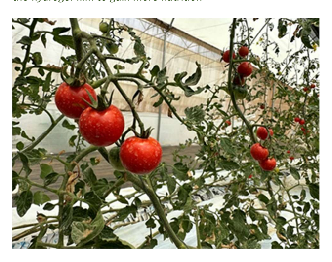
Cherry tomatoes cultivated with Imec exhibit a very bright red color and are much sweeter than ordinary cherry tomatoes