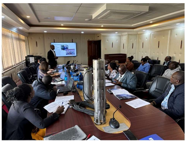
Ebara brought their various products to the seminar hall and explained the features of each product to the participants.