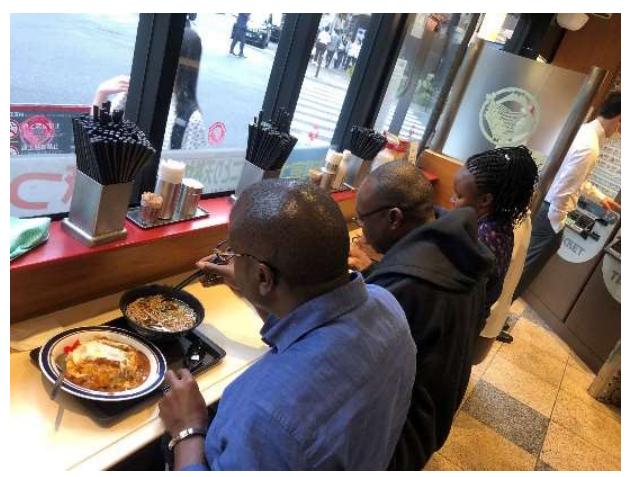
Despite the tight schedule, participants tried their best to enjoy Japanese culture