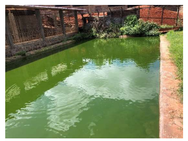
A fishpond constructed with STEIN