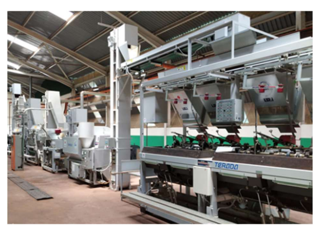
Crude tea processing line by Terada