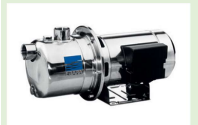
Left: Surface pump Self-priming JES-JE

Ebara offers a variety of products, including surface pumps, submersible drainage pumps, borehole pumps and motors, circulators, and inline pumps.