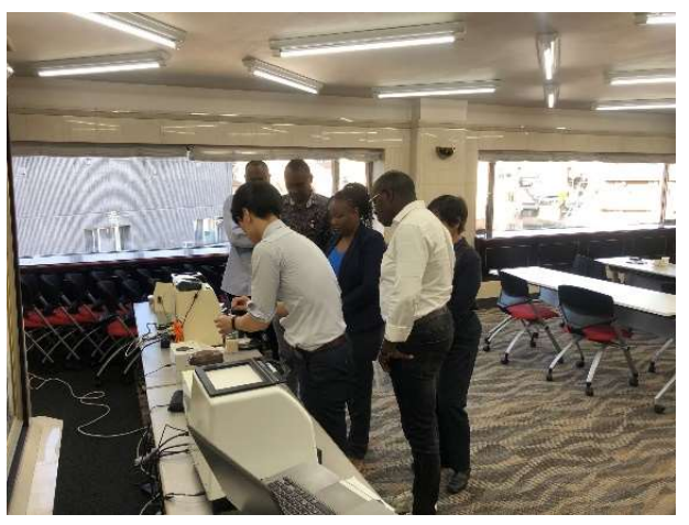
Participants actively discussed the possibility of adopting Japanese products in Kenya (at Kett head office)

The training course and network established are expected to significantly enhance the relationship between Kenya and Japan, facilitating the adoption of Japanese technologies and products within the Kenyan agriculture sector.