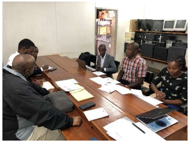
Kenyan stakeholders having a lively discussion on the detailed test plans