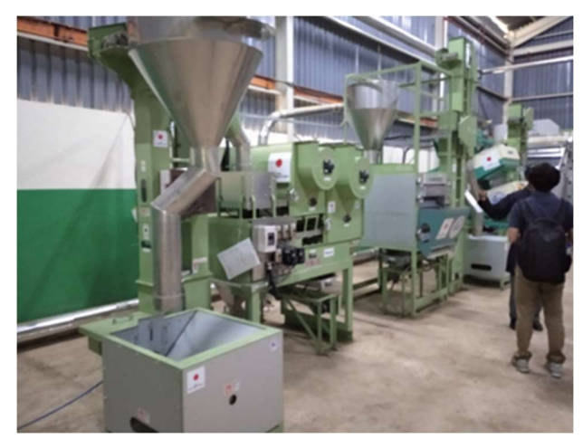
Tea processing finishing machine by Shizuoka