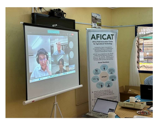
Kett international sales staff joined the seminar online from Japan and provided an insightful lecture on grain moisture measurement and management.