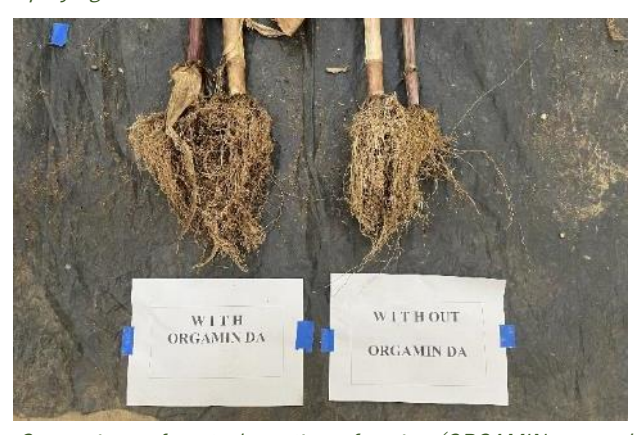
Comparison of root elongation of maize (ORGAMIN-sprayed area on the left)

Company Name: Pulsar International Corporation Website Address: https://orgamin.com/ Website YouTube