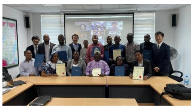
Participants from African countries who presented their action plans.