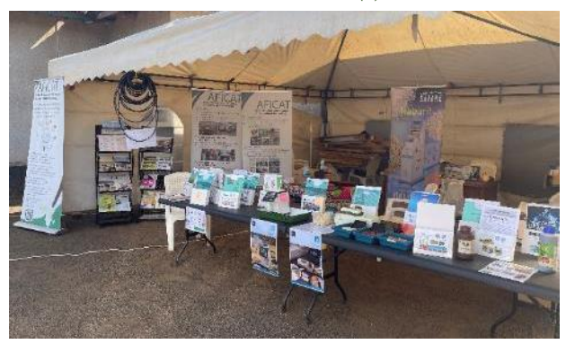
The AFICAT stand at the Arusha venue (2)