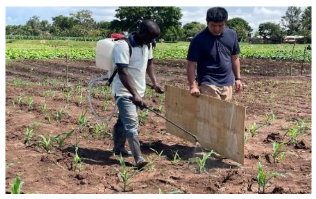
Spraying ORGAMIN to maize