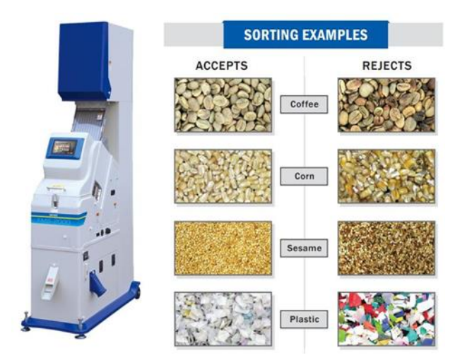
Satake optical sorter FMS-2000.

In Tanzania, some rice millers have already adopted the optical sorters showcased in this demonstration, while others expressed interest in purchasing the machines. Some participants even requested estimates, indicating a strong level of interest among stakeholders that is expected to drive widespread adoption in the future.