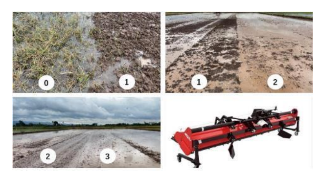
Comparison of results per number of operations.

From June to August 2023, KATC undertook paddy field preparation utilizing a drive harrow (rotary developed for puddling work) from Matsuyama Plow MFG Co., Ltd. (Matsuyama). Typically, in the paddy fields surrounding KATC, contractors and others employ rotary with 70-75 hp tractors for paddy field preparation. However, during this period, KATC opted for a 58 hp tractor, which falls within the horsepower range suitable for the drive harrow, for their paddy field preparation work.