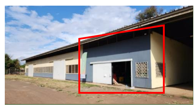
The AFICAT showroom exterior (red frame in the photo)

The AFICAT showroom officially opened at KATC at the end of September 2023. Currently, 16 Japanese companies are showcasing a variety of materials including brochures, flyers, product samples, photos, and promotional videos. These materials encompass not only the AFICAT pilot activities of each company but also highlight their respective offerings.