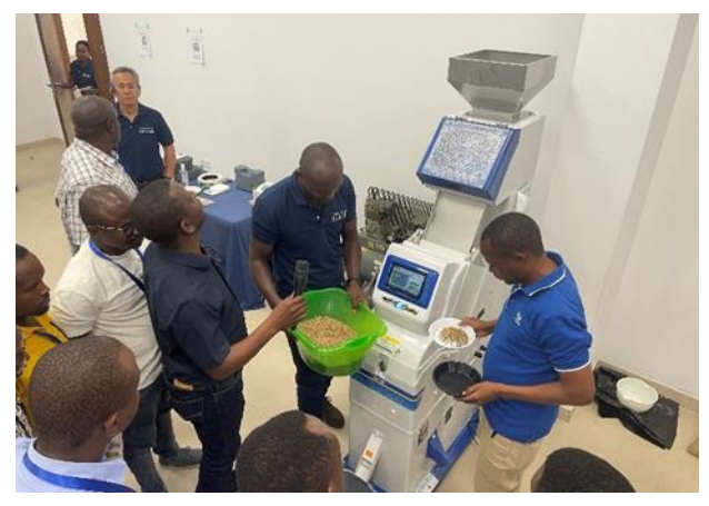
Participants sorted the rice they brought in using an optical sorter.