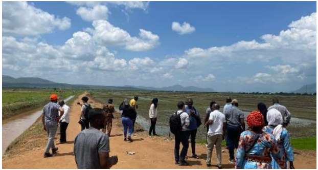
Visiting paddy fields in Mombo irrigation scheme in Tanzania

AFICAT Newsletter (Tanzania No. 3) Kaihatsu Management Consulting, Inc. All rights reserved.