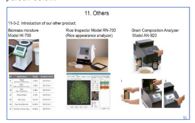
Presentation slides by Kett (extracts)

During the Q&A session following Kett's product presentation, participants not only asked specific questions about the company's sales performance in Africa but also emphasized the importance of reasonable pricing and product durability. They also expressed keen interest in moisture meters made in Japan known for their high measurement accuracy. For further information about Kett's products, please contact the designated contact person below.