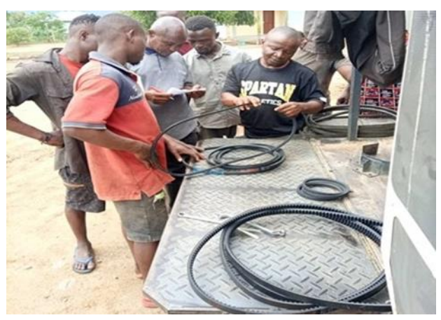
Farmers replacing the combine harvester belts sent from Bando.

Subsequently, in June 2023, the AFICAT team initiated an investigation in collaboration with a farmers' cooperative in the Mombo Irrigation Scheme in the Tanga Region. The belts were installed on a Kubota DC70 combine harvester and their durability was compared with locally available belts. The AFICAT team has been diligently monitoring the durability test in cooperation with the farmers' cooperative.