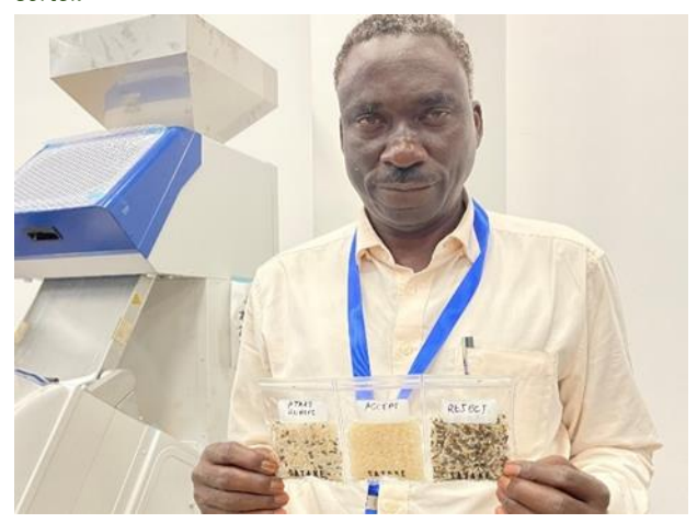
Green coffee beans being sorted by optical sorting machine.

Company: Satake Corporation Website: <a href="https://www.satake-group.com/index.html">https://www.satake-group.com/index.html</a> Website YouTube