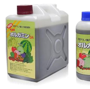
ORGAMIN DA, foliar fertilizer by Pulsar International

The KATC and AFICAT teams applied ORGAMIN to maize and rice plots during various growth stages and conducted yield comparisons. The sprayed areas produced higher yields compared to the nontreated areas, with maize showing significant root elongation in the sprayed plots. The results of the spraying and yield comparisons are showcased in the KATC showroom.