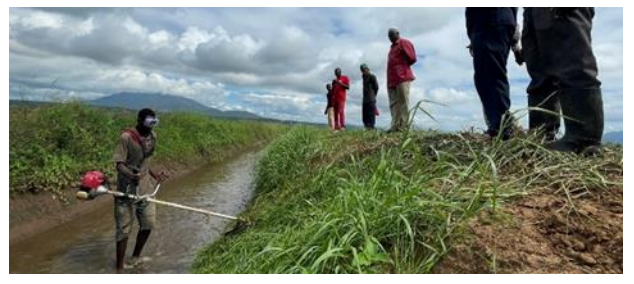
Mowing along the irrigation canals with the brush-cutter (UMK450T).