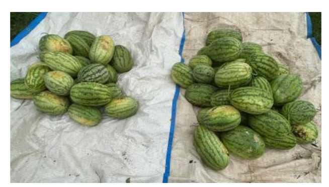
Comparison of watermelon yields (FUJIMIN-sprayed area on the right)