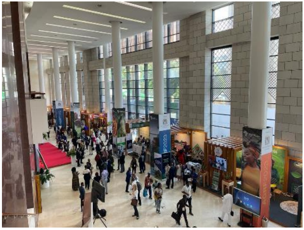
At the Seminar venue