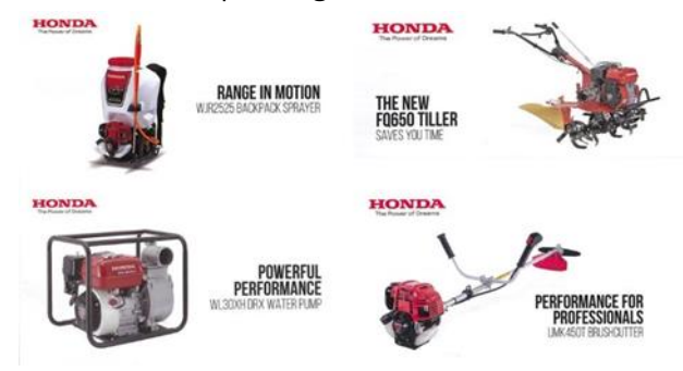
Power Products used in this test.

Of particular significance, there were no breakdowns or damage to the machines throughout the seven-month period. This outcome underscores the high durability of Honda products and the diligent daily management and maintenance carried out by cooperative members. The AFICAT team will report the activities and findings to Honda and will continue to support Honda in promoting mechanization among small farmers and expanding its activities.