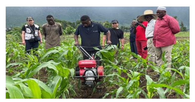
Tiller (FQ650) working inter-tillage in maize fields.

Subsequently, the cooperative members established service charges for the use of the machines based on their previous manual work service charges and gradually began contracting services for their farming activities within the irrigation scheme.