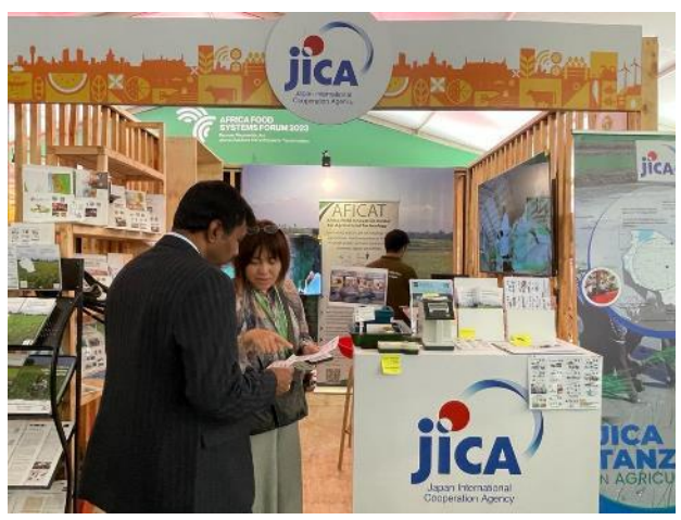
The AFICAT booth at AGRF 2023