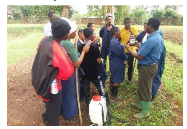
KATC staff introduces FUJIMIN to BBT-YIA students.