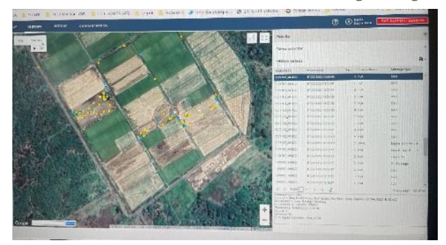
On-site Work history in the fields can be viewed on a PC screen.

Company Name: Tierra S.p.A. Website Address: <a href="https://www.tierratelematics.com/">https://www.tierratelematics.com/</a> E-mail: <a href="mailto:info@tierratelematics.com">info@tierratelematics.com</a> Website Movie(vimeo)