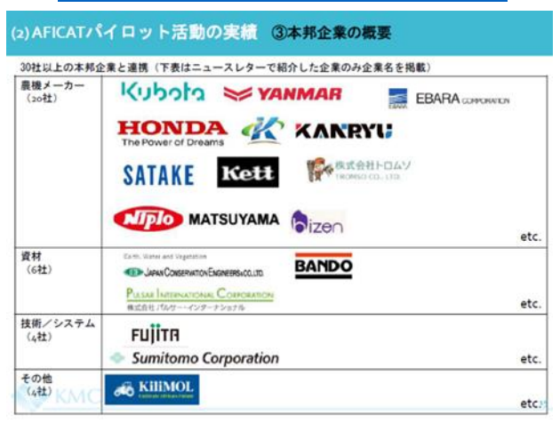
The AFICAT team's slide in Japanese. More than 30 Japanese companies benefitted from AFICAT support

Agriculture Co-Creation Hub: https://www.jica.go.jp/Resource/tsukuba/e nglish/office/activities/activities_11.html