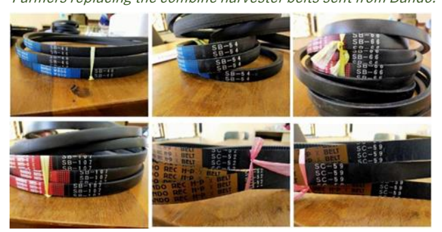
The Six Bando Belts used in the investigation.