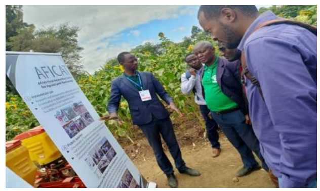
TARI staff presenting AFICAT at the TARI stand at the Mbeya venue.

Japanese products at the Mbeya venue too.