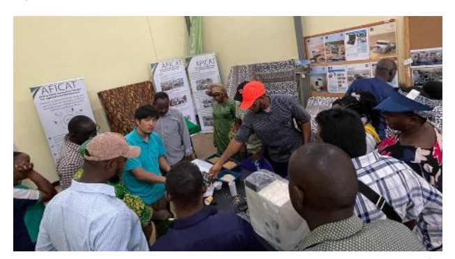
Government officials from East and West African countries (13 from 10 countries) visiting KATC for a JICA training program (November 27, 2023).