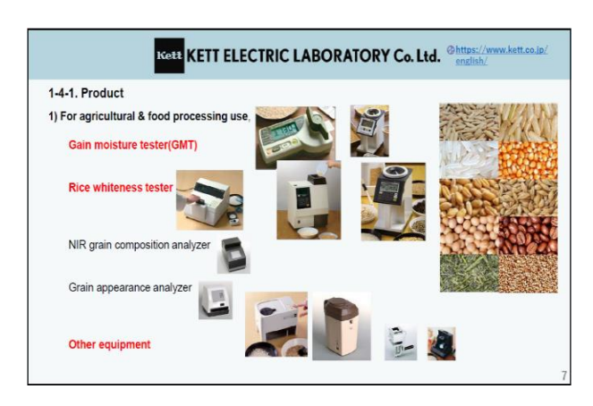
Images of Kett's products from the seminar material, such as grain moisture testers and rice whiteness testers

During the event, Kett presented topics such as "Importance of Grain Moisture" and "Accuracy and Traceability of Grain Moisture Measurement" and introduced their products, such as some types of grain moisture testers, paddy huskers, polishers, and rice whiteness testers.