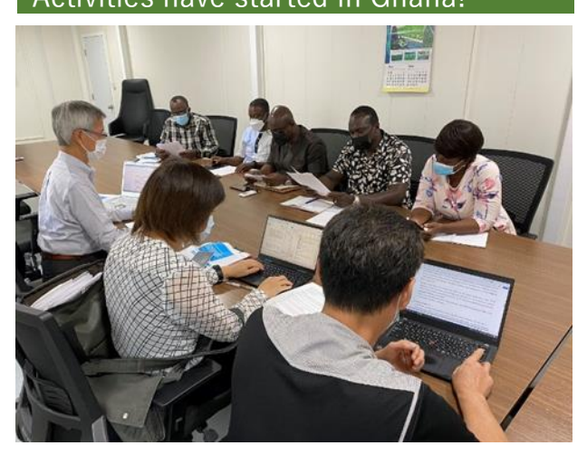
AFICAT works with three main counterpart organizations: MoFA-AESD, MoFA-DCS, and GIDA in Ghana. The AFICAT implementation structure was discussed among representatives from the three organizations and the AFICAT team.

The AFICAT team conducted its first field activity in Ghana from late June to early July 2022. They discussed and agreed with the relevant departments under the Ministry of Food and Agriculture (MoFA), Ghana Irrigation Development Authority (GIDA), and other related organizations to officially kick off AFICAT's activities in Ghana.