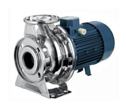
The Model 3M

Ebara Corporation (Ebara) is a Japanese water pump manufacturer ranked the world 5<sup>th</sup> in sales volume. Ebara has several subsidiaries and representative offices in some sub-Saharan African countries but not in Western Africa. In September 2022, Mr. Takeshi Tsuji, the African Market Development Project Manager, visited Ghana to conduct a local water pump market study to identify the market needs and elaborate its business plan for Ghana.