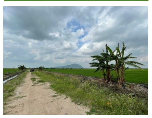
In July 2022, the AFICAT team visited Kpong Irrigation Scheme (KIS), which is managed by GIDA. KIS, where other JICA projects have been conducted since 2016, is one of the possible sites for AFICAT demonstrations of Japanese machines.

It was officially agreed that the Agricultural Engineering Services Directorate (AESD) and Directorate of Crop Services (DCS) of the MoFA and GIDA are the three leading counterpart organizations on the Ghanaian government side to run AFICAT. The Minutes of the Meeting were signed by the Acting Chief Director of MoFA (MoFA is also administratively responsible for GIDA), JICA headquarters, and the AFICAT Team. The parties that make up these AFICAT activities work together as a team to create and implement activity plans. We, the AFICAT Team, would like to take this opportunity to appreciate generous support from the MoFA, GIDA, JICA headquarters,