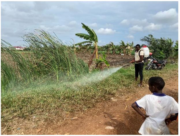
A farmer operating the backpack sprayer was surprised at its intense water pressure and easiness of carrying.