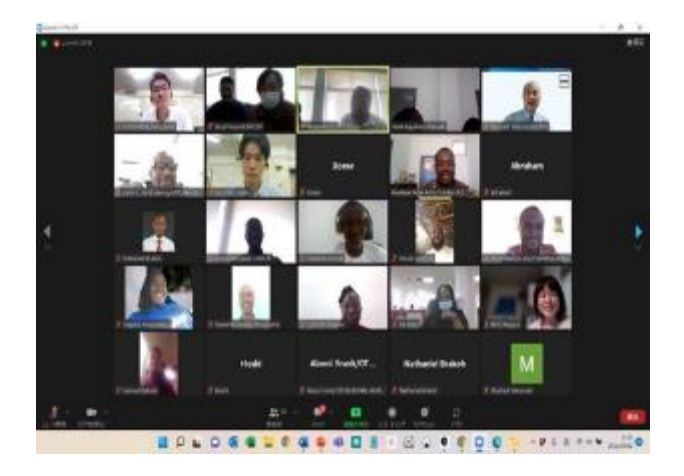
More than 40 participants attended the seminar and exchanged opinions on Zoom.

The follow-up seminar by Kett will be conducted in February 2023 in Accra, offering participants an opportunity to use Kett products. The AFICAT team continues to support Kett's activities in Ghana.