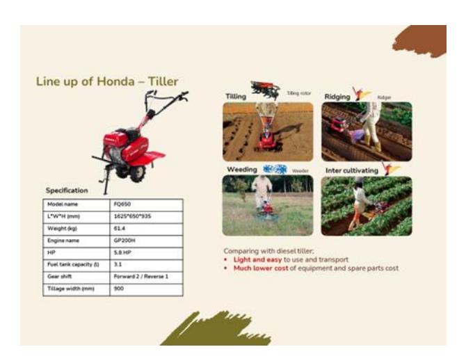
Image of the Honda's power tiller equipped with a 6-hp gasoline engine (FQ650)