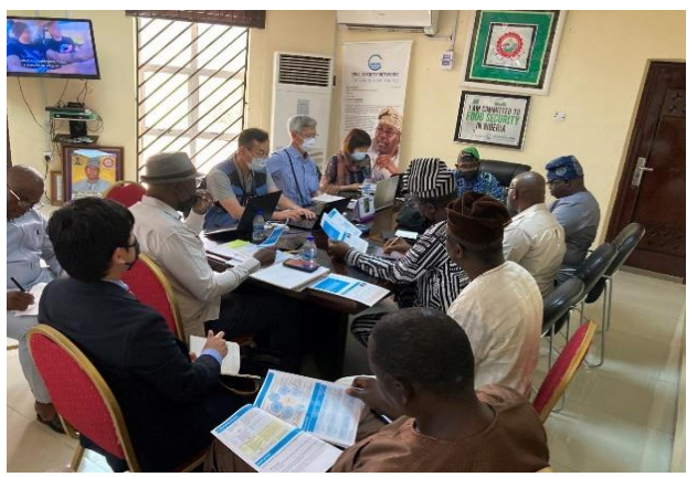
Photograph of the visit to NCAM in Ilorin. The AFICAT team and the officers of NCAM had a positive discussion with each other

From mid-May to the end of June 2022, the AFICAT team conducted its first field activities in Nigeria. The AFICAT team discussed and agreed with the relevant departments under the Federal Ministry of Agriculture and Rural Development (FMARD), National Centre for Agricultural Mechanization (NCAM) and other related organizations to officially kick off AFICAT's activities in Nigeria.