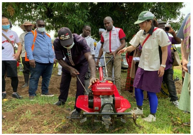
In the demonstration, some of the participants experienced the operation of the tiller in the farm field of Nasarawa ADP

Under the arrangement of the AFICAT team, Honda and their subsidiary company in Nigeria, Honda Manufacturing (Nigeria) Ltd, conducted its first seminar. This included a demonstration of their agricultural machineries as an activity in AFICAT in Lafia, the capital city of Nasarawa state. There were around 30 participants in total, which includes those from FDA and ABM of FMARD, NCAM, Nasarawa Agricultural Development Programme (Nasarawa ADP), and farmers from the surrounding area. At the beginning of the event, the Commissioner of Agriculture and Water Resources in Nasarawa ADP offered opening remarks.