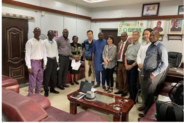
Photograph of the meeting with the commissioner, the permanent secretary and officers of Oyo State

The AFICAT team also visited Nasarawa state and Oyo state as potential sites for future pilot activities. In Oyo state, the commissioner and the permanent secretary of Ministry of Agriculture and Rural Development welcomed the AFICAT team and expressed their hope that Oyo state will be selected as a pilot area in future.