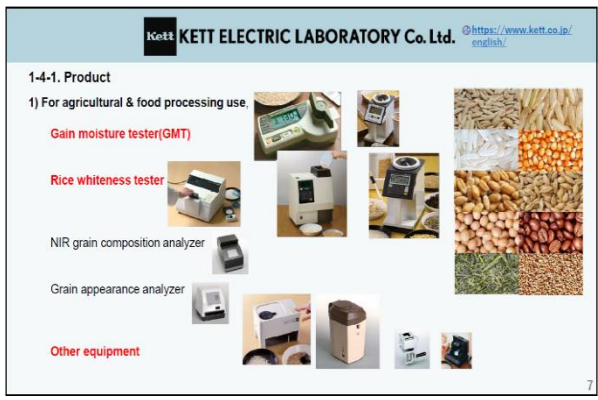
Images of Kett's products from the seminar material such as grain moisture and rice whiteness testers

During the seminar, there were some positive comments from the participants, such as "I was amazed by the technologies of Kett's products", "I realized the importance of further dissemination of post-harvest knowledge in Nigeria" and "there will be increasing demand of moisture testers for parboiled rice in Nigeria." The follow-up seminar by Kett will be conducted in October in Abuja, offering the participants an opportunity for using Kett's products. The AFICAT team will continue to support Kett's activities in Nigeria.