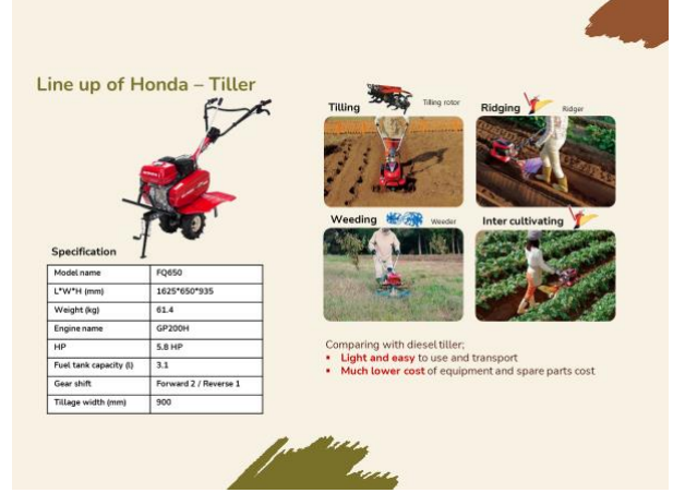
Image of the Honda's power tiller equipped with a 6-hp gasoline engine (FQ650)

use & fix, and therefore smallholder farmers including women can afford and manage these machines so that they can increase agricultural productivity and save on labor costs and time with these machines. Through the demonstration, the participants experienced an operation of the tiller and expressed their high interest in the product. In particular, some of the participants seemed to be amazed by the tiller's performance, relatively high power, and easiness of handling, even though the size is small.