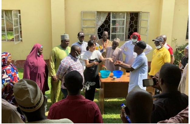
Photograph of explanation of the way of maintaining the tiller by Honda staff

During the discussion session, Honda and participants exchanged their views and opinions in a frankly and lively manner. Some farmers indicated that they would like to consider purchasing the tiller because of the affordable price. Regarding questions about Honda's maintenance service structure in Nigeria, Honda explained their broad service network, including more than 100 dealers, in the country.