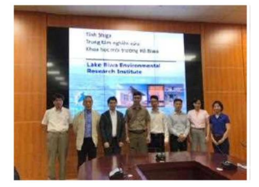
Shiga prefecture cooperated to conduct seminars.

Output 3: a sustainable tourism plan is conducted.