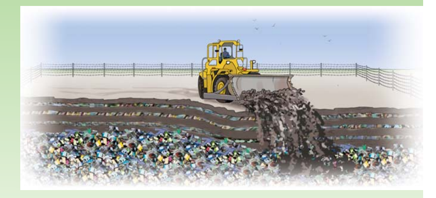
Provide soil cover regularly at the temporary disposal site.