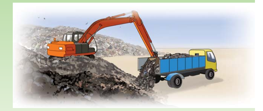
use excavator for unloading waste from open trucks.