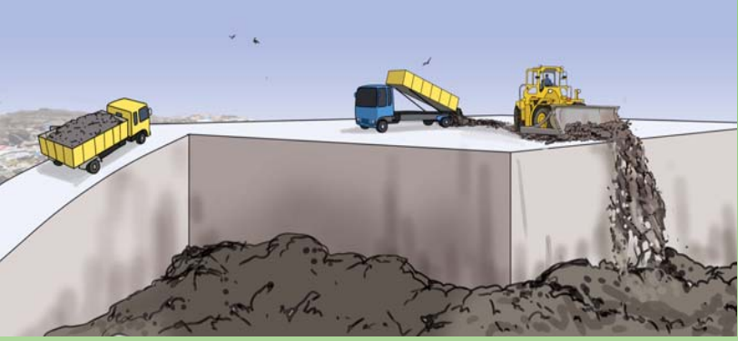
Regularly Clean the dumping platform by pay-loader.

# Dispose infectious waste at designated disposal