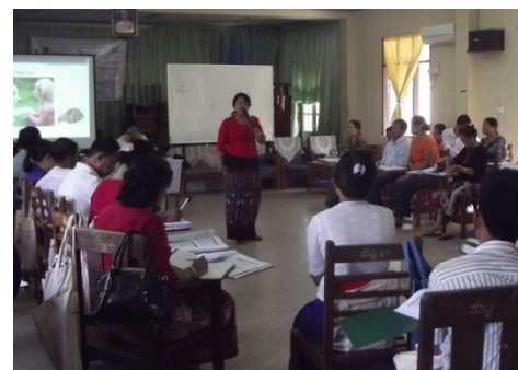
Participants in a training program in Myanmar