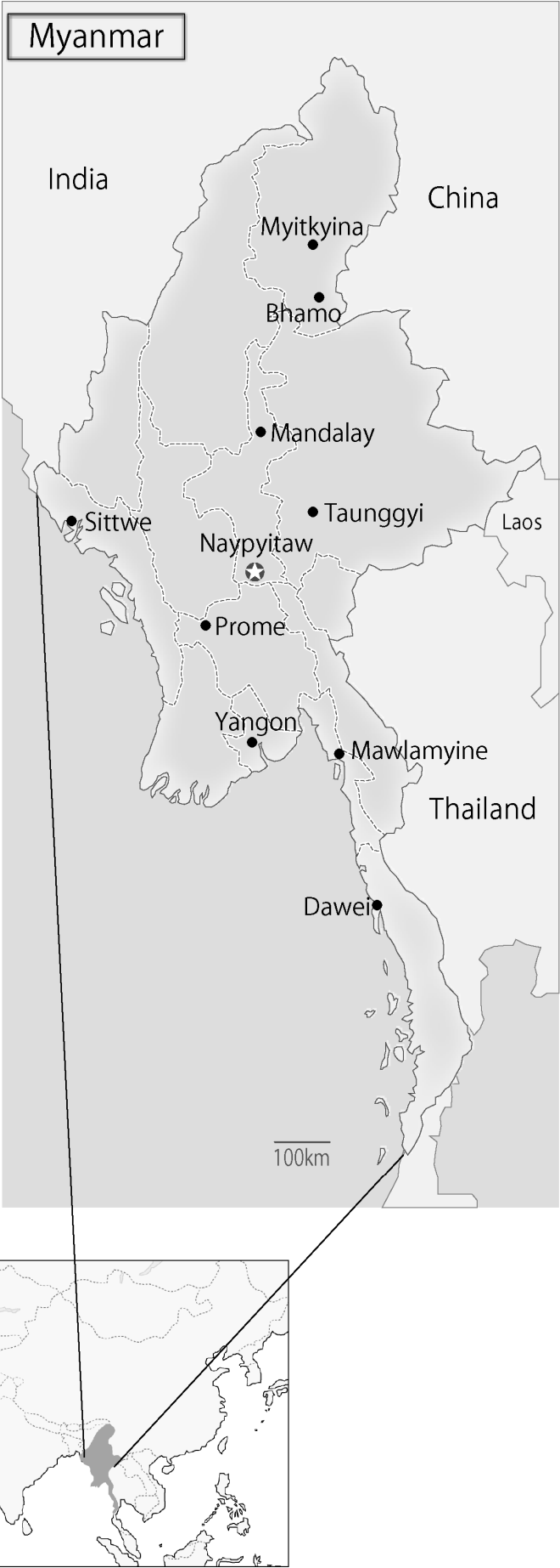
Map of the Republic of the Union of Myanmar