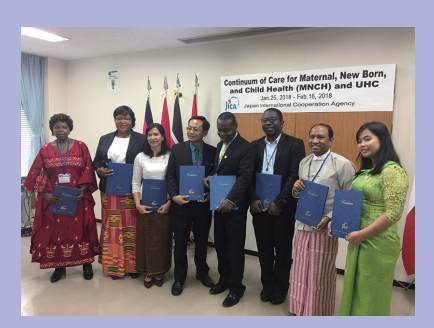
Knowledge Co-Creation Programs, Japan

177 technical cooperation projects and 24 ODA grants, spending approximately JPY 7.3 billion and JPY 29.1 billion financial commitment, respectively (JFY2017 -2021)