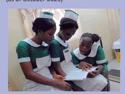
Training on MCH handbook use, Ghana

34 (or more) countries have introduced MCH handbook with JICA's technical cooperation (as of October 2023)