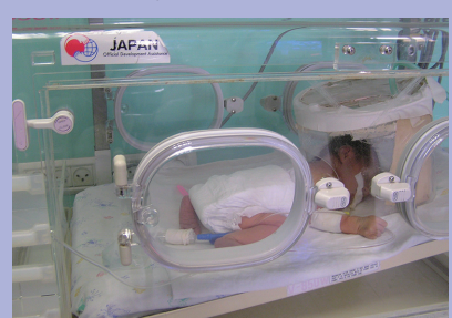
Provision of Equipment, Palestine

177 technical cooperation projects and 24 ODA grants, spending approximately JPY 7.3 billion and JPY 29.1 billion financial commitment, respectively (JFY2017 -2021)