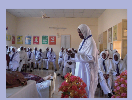
Training at a Midwifery School, Sudan

11,568 health care workers trained on MNCH (JFY2017 -2021)