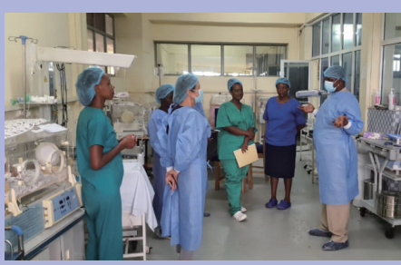
Training for neonatal intensive care, Burundi

34 (or more) countries have introduced MCH handbook with JICA's technical cooperation (as of October 2023)