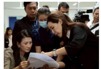
Thai hospital staff providing guidance to Lao staff during training (Thailand)