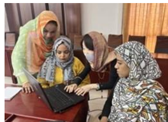
A Japanese expert advising trainers during facility accreditation training (Sudan)

Government officials and health professionals trained on financial protection systems and UHC