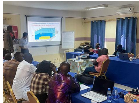
A capacity-building training for staff of the departmental health insurance unit

Through the DPL, JICA provides policy-level support, including financial assistance for premium subsidies for the poor and development of health financing strategies. Technical cooperation projects focus on strengthening organizational capacity through training and equipment and improving the monitoring capacity of health insurance implementing agencies and healthcare providers in target regions. These efforts enhance the implementation capacity of community-based health insurance systems at all levels.