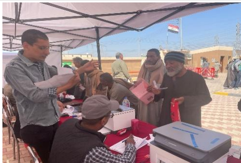
UHS enrollment and premium collection promotion campaign