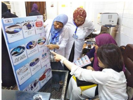
Hospital quality management team discussing patient safety posters