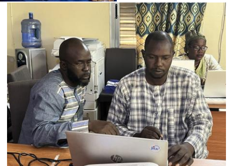
Monitoring and reviewing the utilization of accounting tools