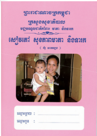
Maternal and Child Health Handbook (pilot version), Cambodia, 2007