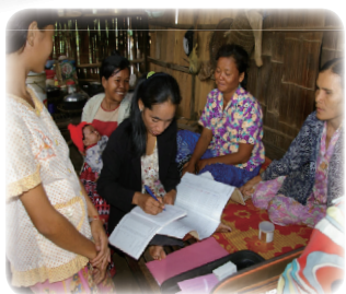
A midwife filling data in an MCH Handbook during antenatal care outreach activities

Concerning maternal knowledge on prevention and breastfeeding, women in intervention group also showed a greater increase in knowledge than those in control group .