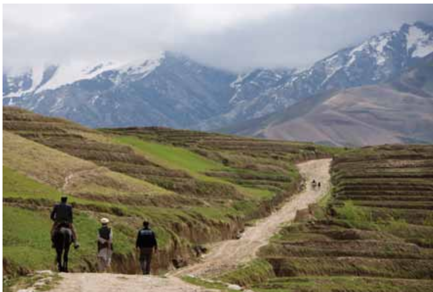
Bull World Health Organ 2010;88:566-567 | doi:10.2471/BLT.10.020810