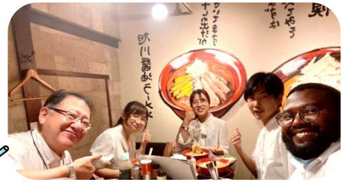
Get-together with coworkers of Maruhachi Tent Co., Ltd