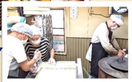
Inspecting production process of Nichiin frozen food products

Make best use of your internship by building valuable networks with your co-workers and employers. These connections might prove to be beneficial even after your internship period. During my internship period, I developed professional, as well as personal networks with my employers at NICHIIIN FOOD Creative Corporation. Because of that, we are still in contact until now, even discussing potential future collaborations .