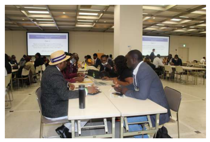
Participants' group discussion sessions.

The next Networking Seminar will be held in December 2023 for those who are scheduled to come to Japan this year.