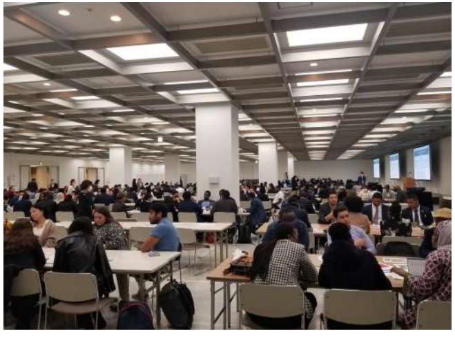
Seminar room was vast enough to accommodate more than 350 participants!

Some participants attended additional sessions provided by various JICA departments. One session was to introduce examples of excelling manufacturing in rural village in Japan. Another session introduced follow-up support in overseas offices after the participants' graduation.