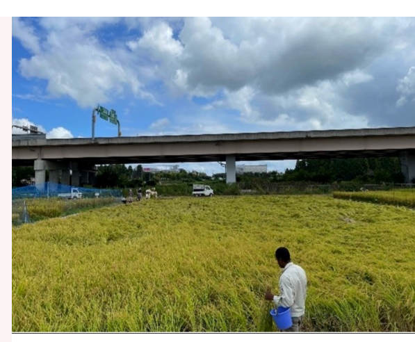
JICA Tsukuba center has three acres of rice field in and outside of the center

On September 16, Tsukuba Center held a harvesting event where Participants and citizens from neighboring area harvested rice grown in the plots. Approximately twenty families around the city came to the center to attend the event and JICA Participants were there to instruct, assist, and have fun with those who joined the day.