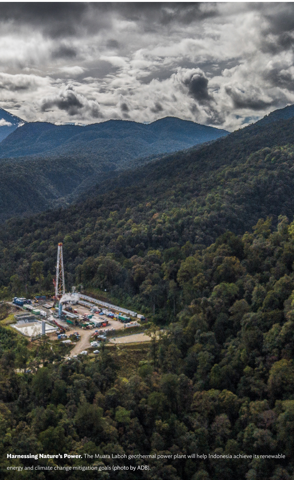
Harnessing Nature's Power. The Muara Laboh geothermal power plant will help Indonesia achieve its renewable energy and climate change mitigation goals.

LEAP-funded projects span across Asia and the Pacific, covering a broad range of sectors such as energy, water, transport, health, and information and communications technology. Below is a sample of projects from LEAP's growing portfolio. Press on each hyperlink to learn more about projects LEAP is or has been involved in.