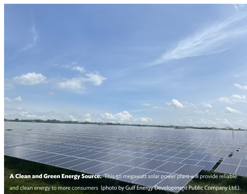
A Clean and Green Energy Source. This 50 megawatt solar power plant will provide reliable and clean energy to more consumers.