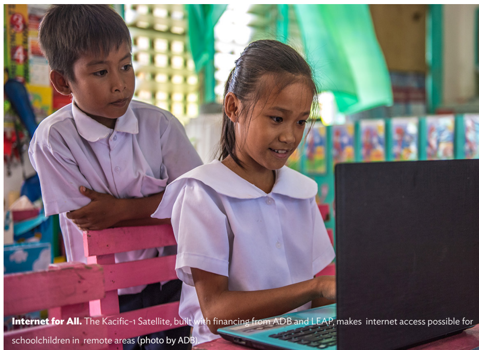
Internet for All. The Kacific-1 Satellite, built with financing from ADB and LEAP, makes internet access possible for schoolchildren in remote areas.