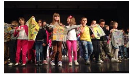
Performance with smile

“To deliver smiles to children who live in refugee collective centers”. Under this motto, Japanese clothing company UNIQLO, and Japanese NPO Action for Children and Communities Hope (ACC Hope), have realized the “Shopping Experience”, on November 9 th and 10 th , 2013, in Belgrade. UNIQLO, well-known as sponsor of Serbian tennis player Novak Djokovic, set the clothing store for two days, in which children could choose and coordinate clothes according to their own sense, and discover experience of shopping. The store was fulfilled with cheerful spirit and smiles, but the seriousness of children while selecting the clothes, tells they don't take this experience for granted. With hope that the event was an opportunity to provide the children with dreams for the future, clothes that children chose were donated. NPO ACC Hope supports refugees in Serbia through JICA's Grass-root Cooperation project since 2011. For details on their activities visit our website: link