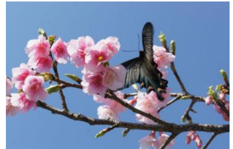
End of January and cherry blossom in Okinawa

From the last week of January in Okinawa to mid of May in Hokkaido, sakura (cherry tree) is blooming while sakura zen sen (cherry blossom front) moves from south to north. When the blossom period comes close, Japanese would keep watching TV news or read news paper as they have the blossom forecast on daily basis. The custom was originally limited to the elite of the Imperial Court, spread to samurai society and, by the Edo period (1603-1867), to the common people as well.