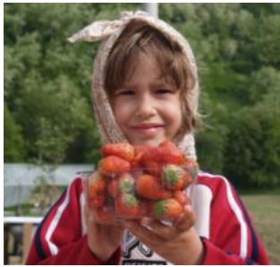
Strawberries made in Srebrenica

During the conflict in BiH, the Town of Srebrenica became the frontline, where Bosnian Serbs and Muslims crossed the fire. In 1995 it became the place where tragic genocide happened. Many took refuge to surrounding countries or other region. Since March 2006, JICA painstakingly continued to provide assistance, to bring the refugees and IDPs back to their homeland. The goal of the project was to support the means of livelihood through agriculture and to rebuild the local community and confidence between ethnicities. During the project 19 activities were realized some of which are herb production and processing, fruits and vegetable cultivation, bee keeping, grass production and management of kindergarten. Project ended in November 2013. However on request of the Government of BiH, "The Project for Confidence Building through Rural Development" started in January 2014. Based on our experience and knowledge gained in Srebrenica, we will implement the project to neighboring towns of Bratunac and Rogatica. Check out the documentary movie about the project: link