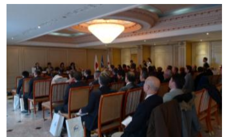
The atmosphere on the seminar

On February 5 th , under the organisation of JICA Balkan Office, the ODA seminar took place in Pristina. As the Government of Japan recognized the independence of Kosovo in March 2008, it started to provide the ODA in 2009. In 2014, JICA celebrates 5 th anniversary. This seminar provided an excellent opportunity to look back on the cooperation that Japan has provided to Kosovo over the past five years, as well as to exchange opinions with key Kosovo personnel on the direction going forward. The Government of Japan and JICA will continue to realize the assistance focused on foundation of Kosovo growth, which is including development of human resources, socioeconomic stabilization and protection of environment. For the details on the seminar, visit our website: link