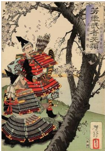
"Courageous Warriors" by Tsukioka Yoshitoshi 1885, (photo, ja.wikipedia.org)

What drives Japanese People, to go out in spring sit beneath the cherry tree and admire the beauty of flower in full bloom? They would walk along side the trees, or they would sit, eat, drink, sing, dance under the cherry tree.