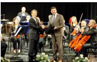
The atmosphere on the ceremony

The presentation ceremony to conclude the Cultural Grant Aid, “the Project for the Improvement of Musical Instruments of the Kosovo Philharmonic Orchestra”, was held in Pristina on March 19 th . During the conflict, the orchestra stopped its activities. It started to be active from year 2000, but was dependant on support of colleagues from surrounding countries, due to the lack of instruments. It is expected for the orchestra to contribute to development of cultural life in Kosovo and to raise new generations of musicians.