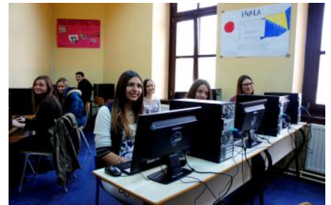
Arigato (thank you) on poster of new IT classroom

Check out the documentary movie about the IT project: link