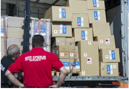
Emergency aid handed over to the Ministry of internal Affairs of Serbia

With hope that both BiH and Serbia will be able to stand on its feet firmly again, as soon as possible, JICA is planning to deepen the cooperation with these countries focusing on mid-term and long-term improvements on flood control knowledge.