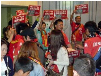
Fans of FC Nagoya Grampus collecting the aid for Dragan Stojkovic Piksi's homeland

Those in BiH and Serbia, who were not struck by floods directly, were struck by images of it on social and public media. Everyone stood up to give support of any kind to those who were affected. The atmosphere of solidarity in BiH and Serbia reminded of the time Japan was struck by the Great earthquake in eastern Japan, followed by devastating Tsunami and nuclear disaster in Fukushima in March 2011. In weeks following the Great earthquake, Serbia was the top donor in Europe and sixth in the World. People of BiH also gathered financial aid that exceeds its own economical power.