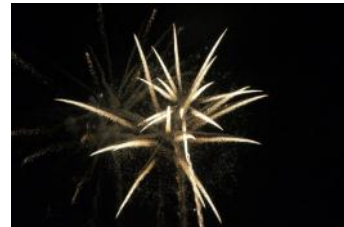
Palm-tree stamine firework