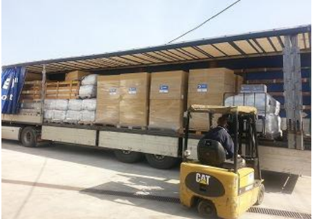
Emergency aid delivered to Sarajevo and distributed to Doboj, Maglic and other flood affected area in BiH

Soon after the floods, the reconstruction of both countries started immediately. But for many, the life in displacement or life without electricity, drinking water continued for weeks.