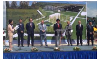
Ground breaking ceremony

On July 9, the ground breaking ceremony for the construction of Greater Tirana Sewerage System was held at the construction site under the flaming Sun exceeding 30 degree with more than 100 participants including the Minister and Deputy Minister for Transport and Infrastructure, Director General for General Directory of Water Supply and Sewerage (DPUK) from the Government of Albania, Japanese company of Kubota and Italian company, the contractor of project, the TEC International, the consultant, the Embassy of Italy, media, etc. The Loan Agreement was signed in June 2008, and looking back long procedures of prequalification, design, bidding, evaluation and contract in close cooperation with DPUK, the ceremony was marked a milestone for the construction of infrastructure of great importance. The construction is scheduled to be completed in December