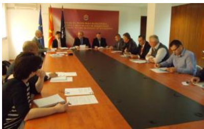
The Final Steering Committee

Commenced in May 2011, the "Project on Development of Integrated system for Prevention and Early Warning of Forest Fires" completed in May 2014 and achieved project purpose and outputs as initially planned. Forest fires are the most serious natural disaster in Macedonia. The successful capacity development of counterpart organization the Crisis Management Centre is attributable to the great efforts made by Japanese long-term experts. Their activities, included procurement of equipment, dispatch of short-term experts, development of integrated GIS system for prevention and early warning for forest fire, which is called as "MKFFIS", various trainings in both Macedonia and Japan, etc. The final steering committee was held on April 9 and MKFFIS has been in public since April 16. It is expected that outcomes of the Project will not only reduce the occurrence of forest fire in Macedonia but also