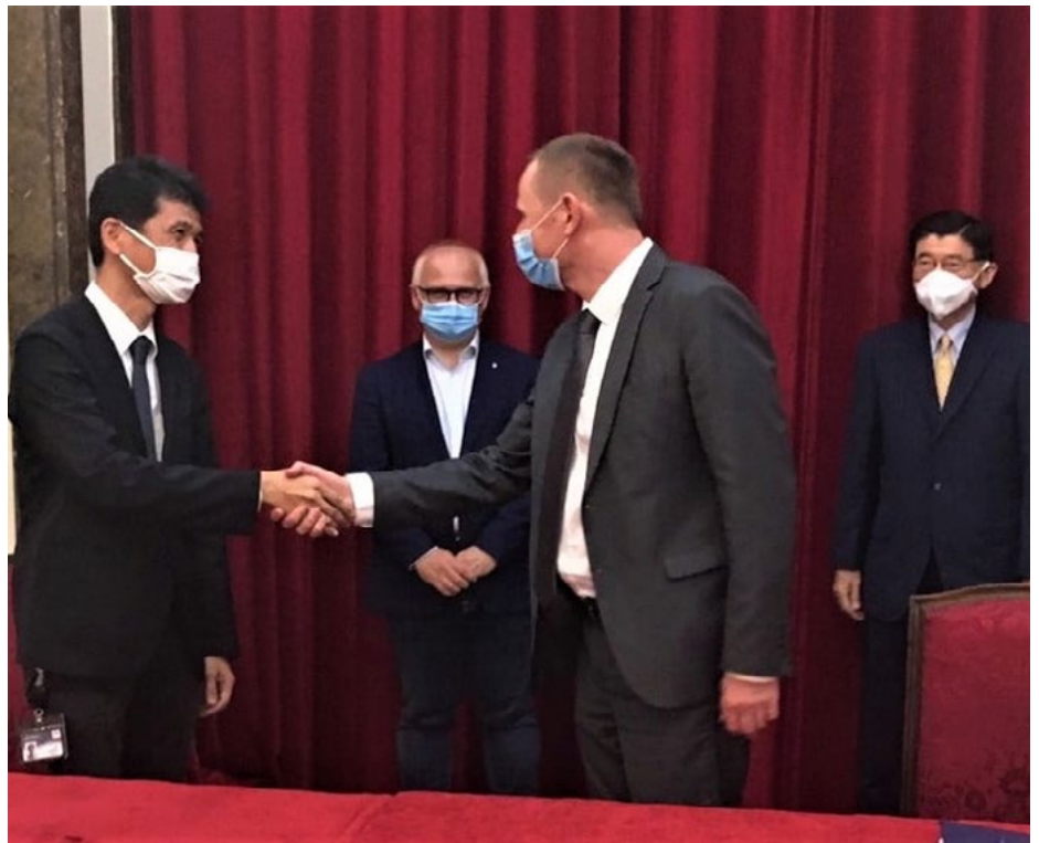
At the R/D signing ceremony

In this project, JICA will not only provide the many years of Japanese know-how in the operation and management of public transportation, but will also consider the utilization of knowledge in public transport projects in neighboring European countries.