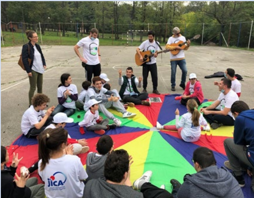
Sports activities with coaches and educators

On October 24, "Eco camp" was organized in children's resort "Suplja stena" on Avala mountain, with the aim to bring together children with and without disabilities to compete, socialize and gain new knowledge and experiences through inclusion. JICA Alumni Serbia and Sport Union for persons with disabilities proposed this SFU with an idea to promote healthy lifestyle, Japanese culture and environmental protection to the persons with disabilities. Due to the current circumstances and limitations imposed by epidemic, all necessary prevention measures were taken, and masks, visors and gloves was provided to all the participants. Three main activities included sport activities, supervised and led by coaches, Origami school, supported by special educators and Eco treasure hunting. For this event, Sport Union for persons with disabilities invited children from two special schools and from one regular school to participate in the activities. Sports equipment, procured by JICA for this event, has been donated to the Sports Union with persons with disabilities and will be used for their activities in the future. After all the activities were completed, the children received diplomas, medals and sweet gifts from Atlantic Stark Company, which supported this event.