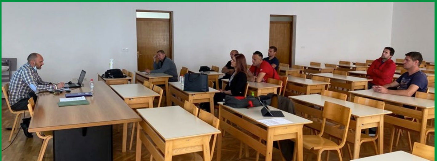
PE teachers attending the last set of professional development training

5, the Project organized the last set in the series of three rounds of such training and the teachers became fully familiar with novel PE teaching practices.