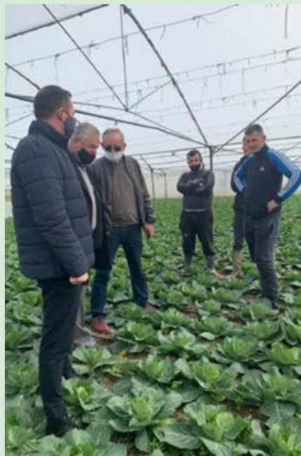
Discussion with farmers during site visits