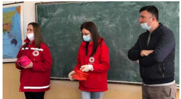
Delivery of personal aid bags to students (village Pestova, municipality of Vushtri)