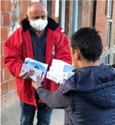
Delivering of DRR brochures in Lipovec village in municipality of Gjakove

In cooperation with the Red Cross of Kosovo, JICA started the project “Follow-up Cooperation for KCCP Community-Based Disaster Risk Reduction (DRR)”. The project aims to build an overall capacity of local communities on preparedness and response to disaster risks within the context of COVID-19 pandemic.