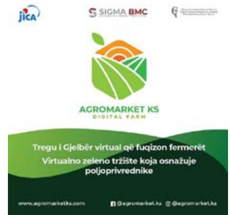
Promotional poster for the platform

For small-scale producers, it is a unique opportunity to promote their products by becoming more visible to urban areas, reaching new buyers and selling directly to them.