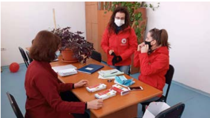
Delivering of information brochures about COVID-19 and earthquake, flooding and fire in Pestova village in municipality of Vushtri

JICA has provided 2000 packages of first aid material and 2000 personal aid bags for citizens from above mentioned villages. In coming period all DRR Clubs will be supplied with the equipment for emergency situations.