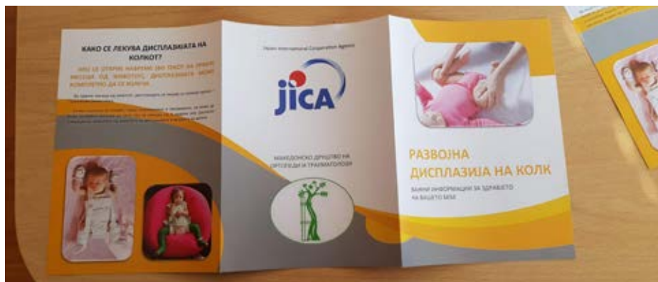
Brochure on "Developmental Dysplasia of Hip"

Webinar titled "Pitfalls of early diagnosis of developmental hip dysplasia" was organized on 3rd December 2020, in collaboration of Macedonian Association of Orthopedics and Traumatology and Pediatric Association of Macedonia and it was accredited by Medical Chamber of North Macedonia. 155 attended, mainly orthopedic surgeons, pediatricians, general practitioners, neonatologists and physiatrists.