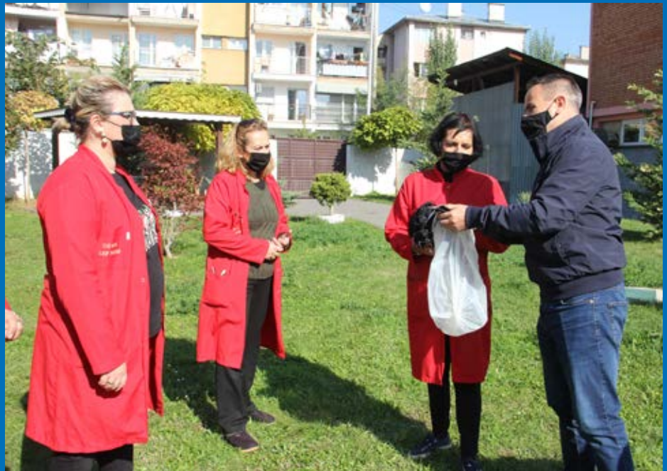
Lef Nosi – hand-over of masks for all children and the staff

This Small-scale Follow-Up (SFU) Project aimed at raising awareness for the proper waste disposal during COVID-19 pandemic through procurement and distribution of re-usable masks, preparation of brochure with explanation on proper disposal of used masks and production of video. During an outdoor activity when waste disposal during COVID-19 was discussed and explained, re-usable masks were distributed to school pupils in the town of Prizren. Brochures with explanation on proper use of masks, proper disposal of used ones and the importance of following the rules and regulations from the relevant institutions were prepared and distributed to the following institutions, Down Syndrome Kosova, Special School “Mother Teresa”, Special School “Lef Nosi”, Association “Autism”. Furthermore, video material with general information on precautionary measures of protection during COVID-19 was produced and aired on national TV RTK, as well as on local TV stations.