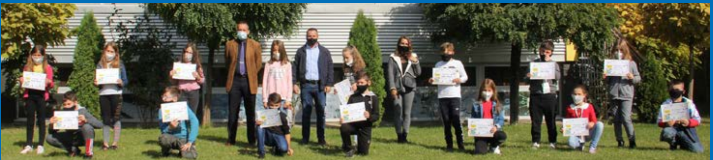
School in Prizren- importance of keeping distance