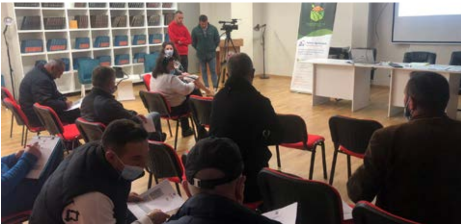
Info session about Agro Market KS platform (Municipality of Gjakova)

Agro Market Ks has been operational from May when all farmers in Kosovo, who want to promote and sell their products, are encouraged to register on this platform.