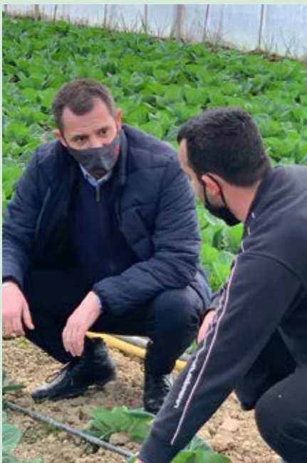
Site visits as a significant part of the research

In order to create the manual, firstly, the consultants conducted the research on collecting and selecting the necessary information that describes the details of the hydroponic technology. The application of hydroponic greenhouses was introduced in the light of all its advantages, starting from the fact that the plants are cultivated at any time of year, without the need for solar energy nor soil, the high productivity, low labor cost, among others. The research was conducted in 4 different sites of Albania (Lushnje, Fier, Berat, Elbasan) and included 28 growers of greenhouse products. The results of the research were reflected in the Guideline.