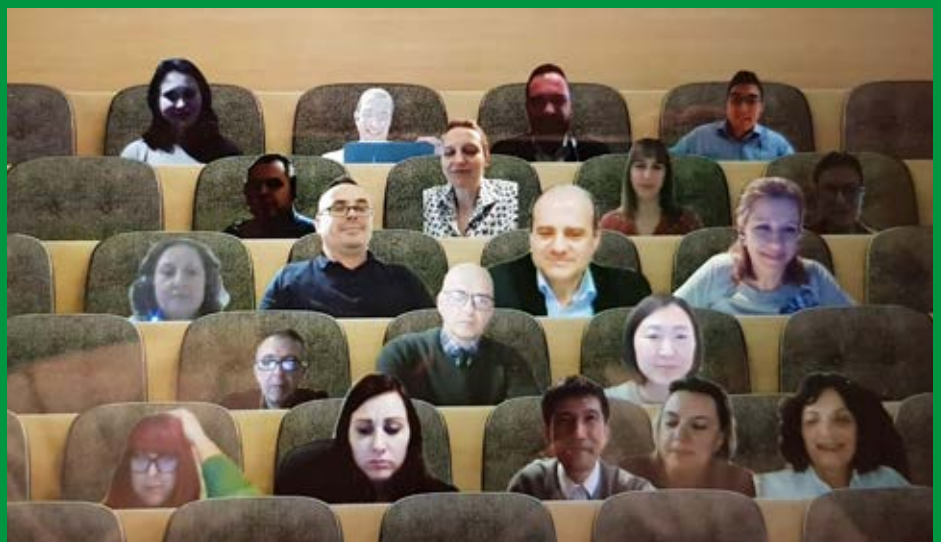
Online regional alumni meeting

On February 24, regional meeting of 5 alumni associations of ex-participants in JICA KCCP programs was held online. The meeting was attended by the Presidents of Alumni associations from Albania, Bosnia and Herzegovina, Kosovo, North Macedonia and Serbia, applicants for Small-scale Follow-Up (SFU) projects and JICA Balkan Office. Since most of the events and seminars planned for 2020, which included gatherings, were cancelled due to epidemiological measures in the respective countries, the agenda of the meeting was mainly focused on exchanging experiences on successful implementation of 6 SFU projects in 2020. Some alumni associations adjusted to the new situation and shifted activities, such as thematic seminars, to the online platforms.