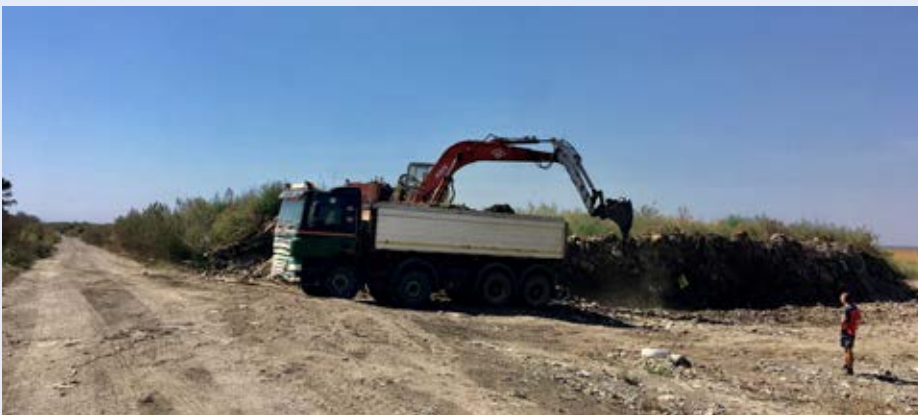
Current landfill in Sid Municipality

R ecord of Discussion (R/D) for “The Project for Capacity Development of Solid Waste Management” was signed with Ministry of Environmental Protection (MoEP), Sid Municipality and Public Utility Company Standard Sid in December 2020. This 3-year technical cooperation project aims at establishing better operation of waste management system, including participation to the regional landfill. JICA’s experts, together with MoEP and the local authorities of Sid Municipality, will develop a plan of source separation, and it is expected to introduce and promote separation and collection of recyclable waste.