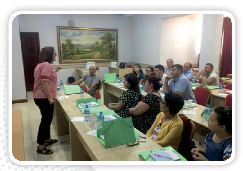
Bookkeeping seminar in Shkodra