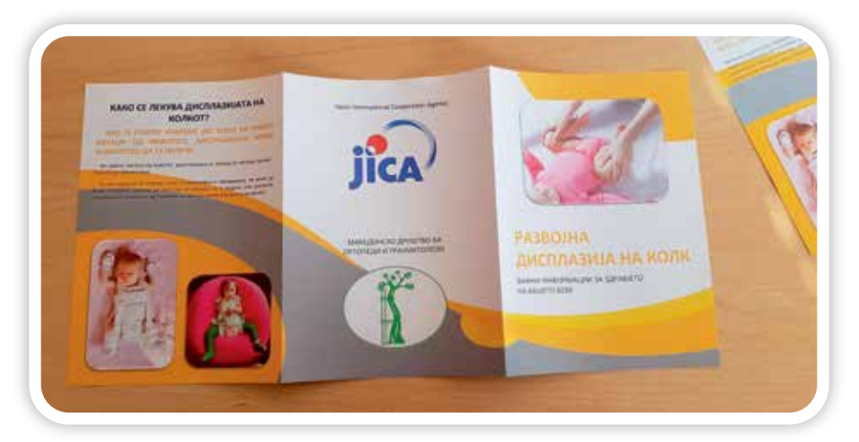
Brochure "Development Dysplasia of Hip"