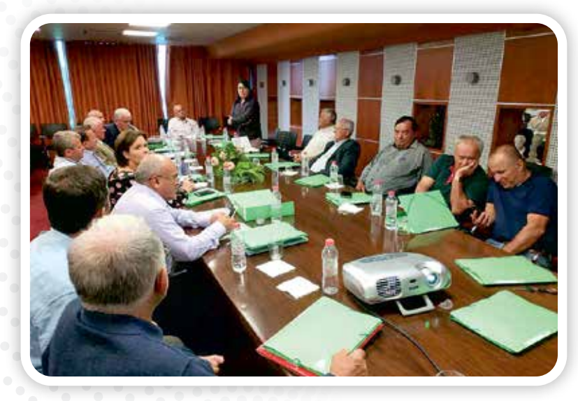
Bookkeeping seminar in Vlora