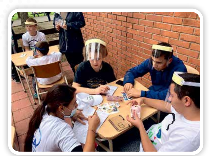
Activities at the Eco camp

The Eco camp is designed as an event that would bring together children with and without disabilities to compete, socialize and gain some new knowledge and experience through inclusion. All of the planned activities promote healthy lifestyle and improve psycho-physical condition of every person, as well as their knowledge on environmental protection and origami.