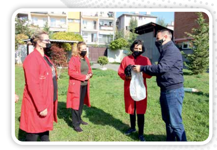
Distribution of protective equipment

By raising awareness of proper use and disposal of protective equipment during epidemic, as well as providing environmental education to primary school children, the waste disposal situation in the community will be significantly improved.