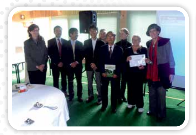
The Closing Ceremony: quests, lecturers and eco-trainers

I can say that I am really satisfied with the outcome of the project and that my wish to bring together pupils and school staff from different schools, with different ethnicity, cultural and national background was fulfilled as well as my aim to connect education, ecology and tourism.