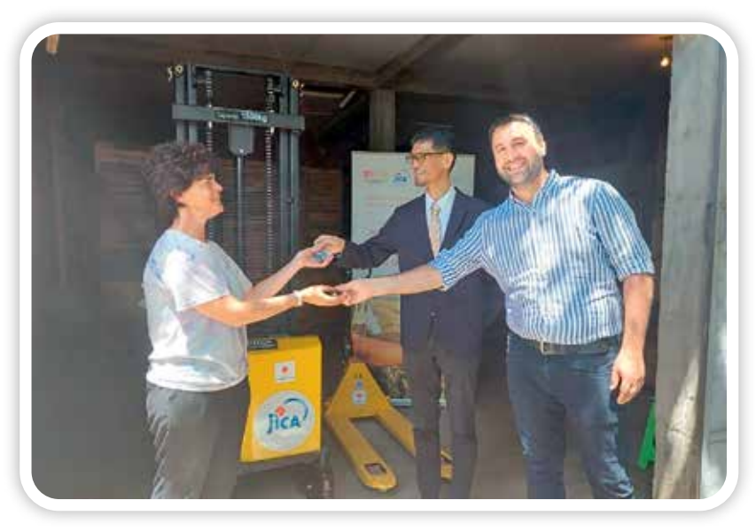
Hand-over of equipment for apple produucers in Resen