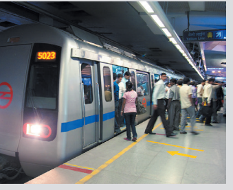
Delhi Mass Rapid Transport System Project Phase 2 (India)

JICA supports the acceleration of developing countries' economic/social growth through the private sector, through debt and equity investment for the development projects of private companies.