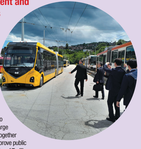
Sarajevo, new trolleybus - site visit of JICA's mission for preparation of the training program on public transportation operation and management for West Balkan Countries

Scheme:Technical CooperationProject Period:October 2024 to October 2026Counterpart organization:Ministry ofForeign Trade and Economic Relations