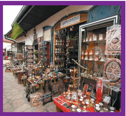
Baščaršija, Sarajevo old town