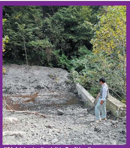
JICA Advisor's site visit to Topčić polje affected by floods in 2024.

The project aims to strengthen the capacity of public agencies for prevention and reduction of forest fires and other natural disasters with National Forest Fire Information System (NFFIS) and Ecosystem Based Disaster Risk Reduction (Eco-DRR). The project will provide dispatch of experts, training in Japan or third countries, as well as the provision of necessary equipment for the project activities. The project is expected to contribute to climate change mitigation and adaptation by strengthening the capacity of Bosnia and Herzegovina to promote innovative climate change solutions for the Western Balkan region.