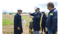
Environmental Improvement in Pancevo, Serbia through the collaborations among Academia, Government, Industry and Citizens

* Applicable programs and cooperation vary from country to country.