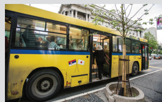
The Project for Rehabilitation of the Public Transportation Capacity in Belgrade City

Grants are the provisions of funds to developing countries that have low income levels, without the obligation of repayment. Grants are used for the improvement of basic infrastructures such as schools, hospitals, water-supply facilities and roads, along with obtaining health and medical care, equipment and other requirements.