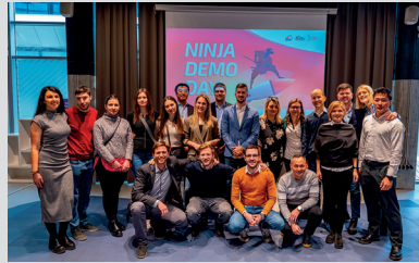
Data Collection Survey of Supporting Start-ups in Europe NINJA Serbia