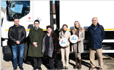
Project for Capacity Development of Solid Waste Management

For the human resources development and the formulation of administrative systems of developing countries, technical cooperation involves the dispatch of experts, the provision of necessary equipment and the training of personnel from developing countries in Japan and other countries. The cooperation plans can be tailored to address a broad range of issues.