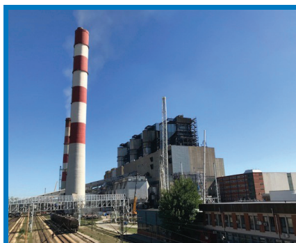
Flue Gas Desulphurization Construction Project for the Thermal Power Plant Nikola Tesla

The project is expected to reduce air pollution (SO 2 ) at the largest thermal power plant in Serbia. It is the first ODA loan in Serbia and the construction is planned to be completed in 2024. The FGD facility will enable TPP Nikola Tesla to fulfill the very strict EU environmental standard -less than 200 mg of Sulphur-dioxide concentration in flue gases per cubic meter. This will provide clean air and a healthy environment to all citizens of neighboring areas.