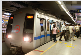
Delhi Mass Rapid Transport System Project Phase 2 (India)

JICA supports the acceleration of developing countries' economic/social growth through the private sector, through debt and equity investment for the development projects of private companies.