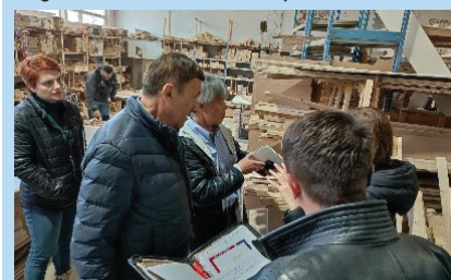
"Gemba walk" (KAIZEN company in Serbia with expert from Japan)

JICA started the first phase of the Project in Serbia in 2008; it expanded to Bosnia and Hercegovina, North Macedonia and Montenegro from Phase 2 of cooperation.