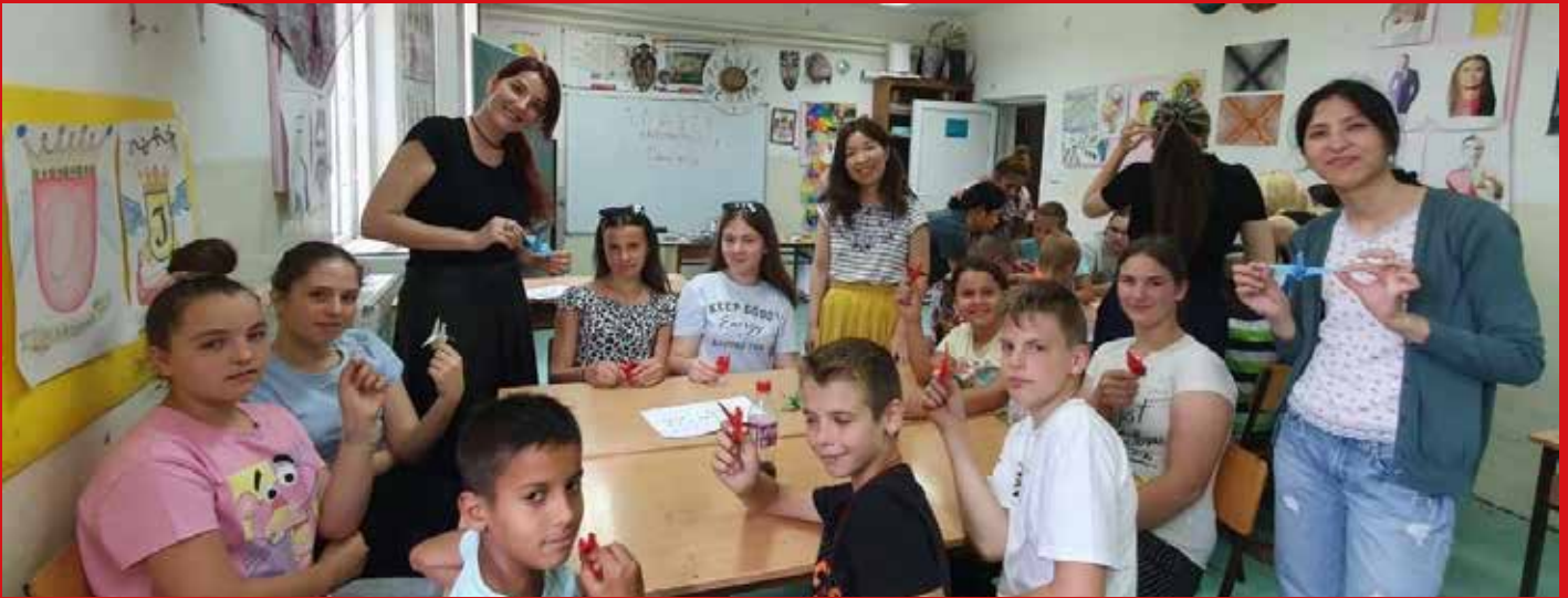
Workshop for the elementary school pupils

Project for Modernization of Public Urban Transport in the City of Belgrade | Technical Cooperation Projects | JICA