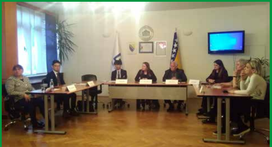
Opening ceremony at the University of Sarajevo

The teaching team consists of highly qualified Japanese professors, trainers from Bulgarian University of National and World Economy (UNWE), who underwent specialization in Japan, as well as lecturers from the SEBS, with extensive practical experience. With this course, JICA assists managers of SMEs and entrepreneurs who are interested in Japanese business management, to take their active role in contributing economy of BiH and jobs creation in the constantly changing business environment.