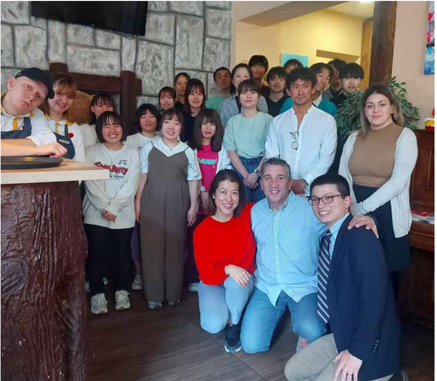
At the café "Zvuci srca" with JICA staff, volunteer and visitors from Japanese school in Switzerland