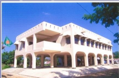
Multi Purpose Cyclone Shelter