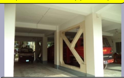
Retrofitting Measure(Steel Brace)